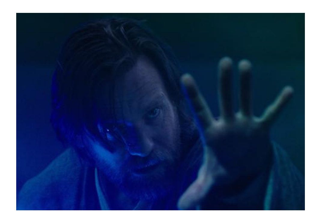
Obi-Wan Kenobi (Ewan McGregor) in Lucasfilm's "Obi-Wan Kenobi," exclusively on Disney+.