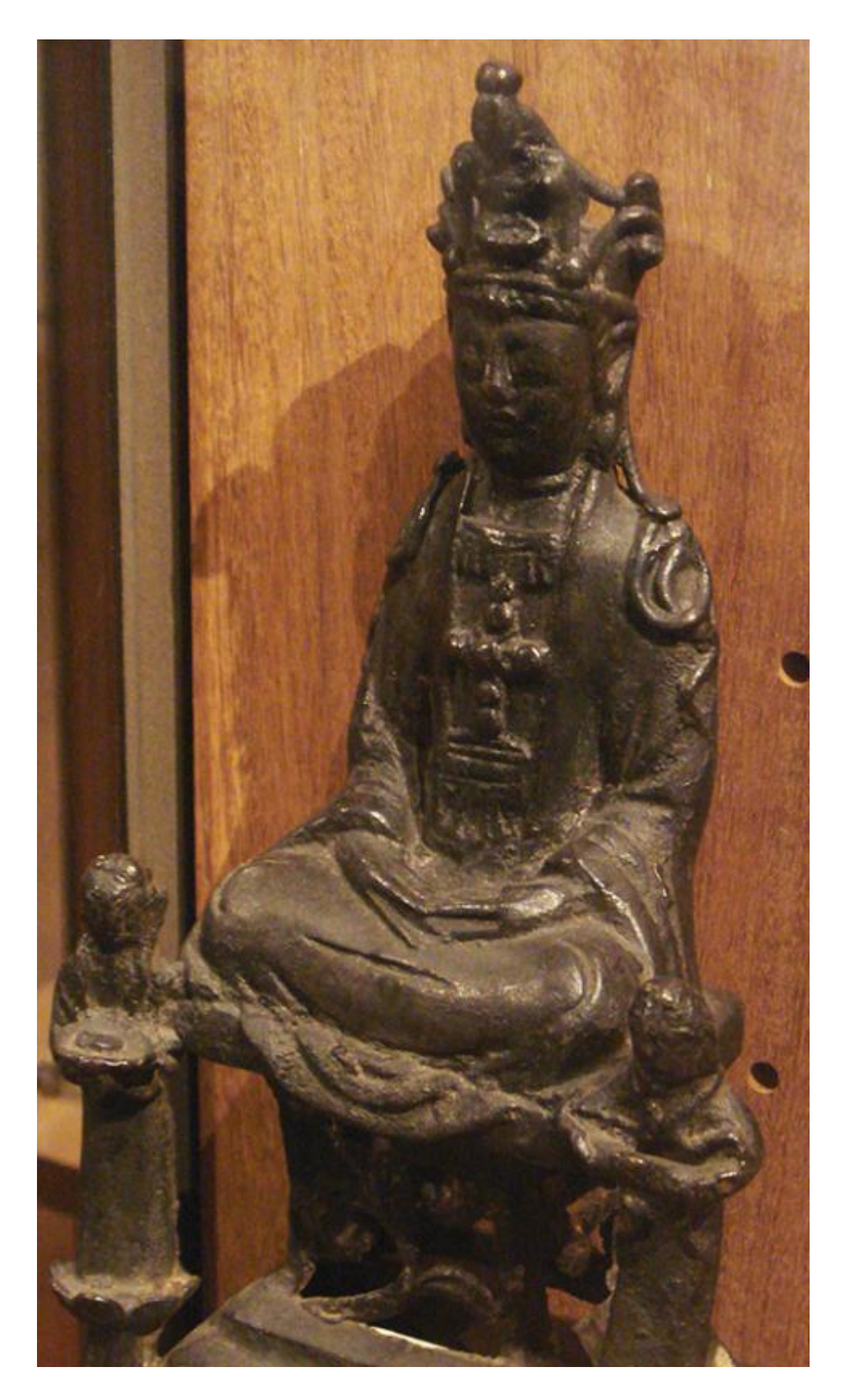
A 17th-century Japanese statue of Mary incorporates imagery of the bodhisattva Guanyin, a feminine deity of compassion in Buddhism.