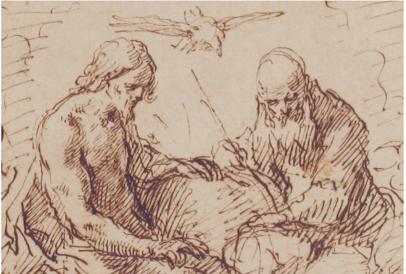
"The Holy Trinity in Glory" (detail), a 17th-century ink drawing by Italian artist Simone Cantarini (Metropolitan Museum of Art)