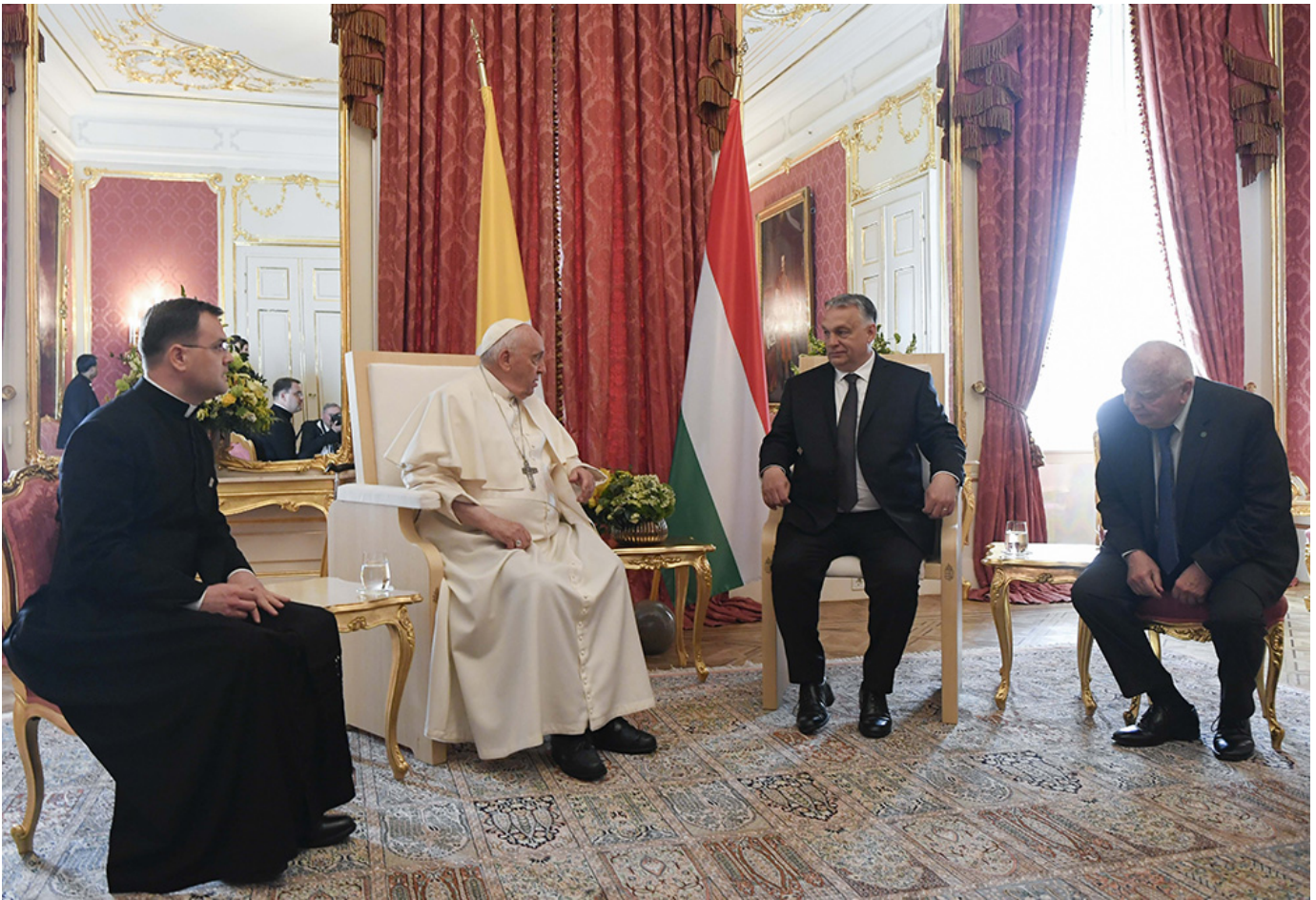
Pope Francis meets with Hungarian Prime Minister Viktor Orbán at Sándor Palace April 28 in Budapest, Hungary.