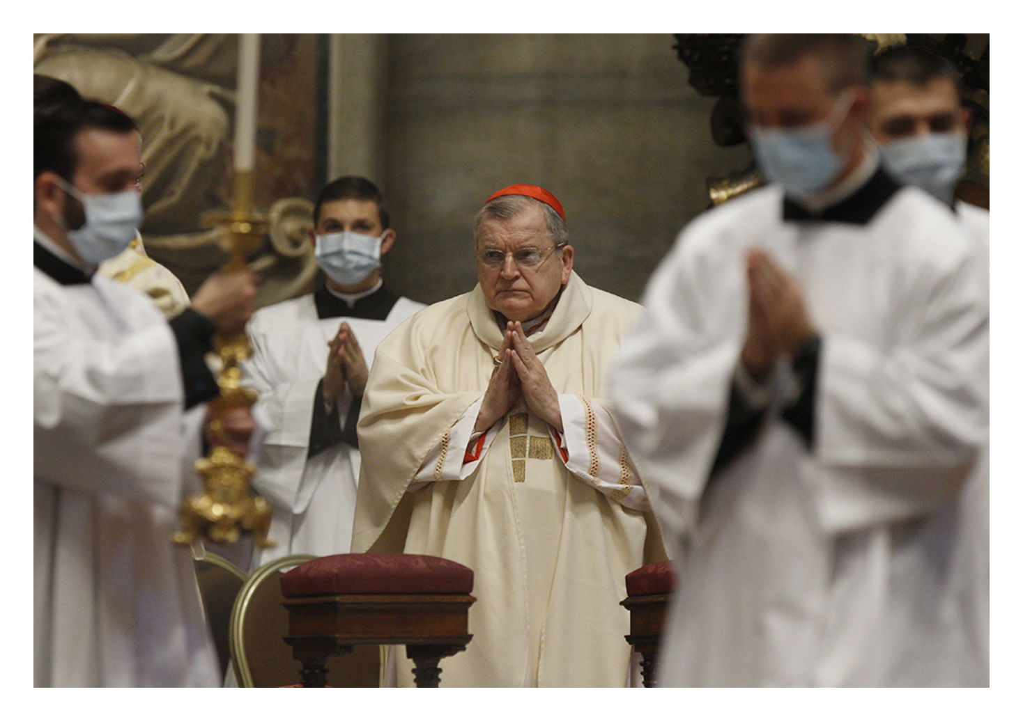
U.S. Cardinal Raymond Burke attends the ordination of eight deacons from Rome's Pontifical North American College in St. Peter's Basilica Oct. 1, 2020, at the Vatican.

Inadequately addressed — and perhaps it is merely an inadequacy of language in need of address — is that these hierarchical characters are beyond any reasonable meaning of the term "conservative" or even "ultra-conservative." The term "extreme" will have to suffice for the moment, particularly when applied to their affiliations with and endorsements of individuals and organizations that make up what has become known as the Catholic right.