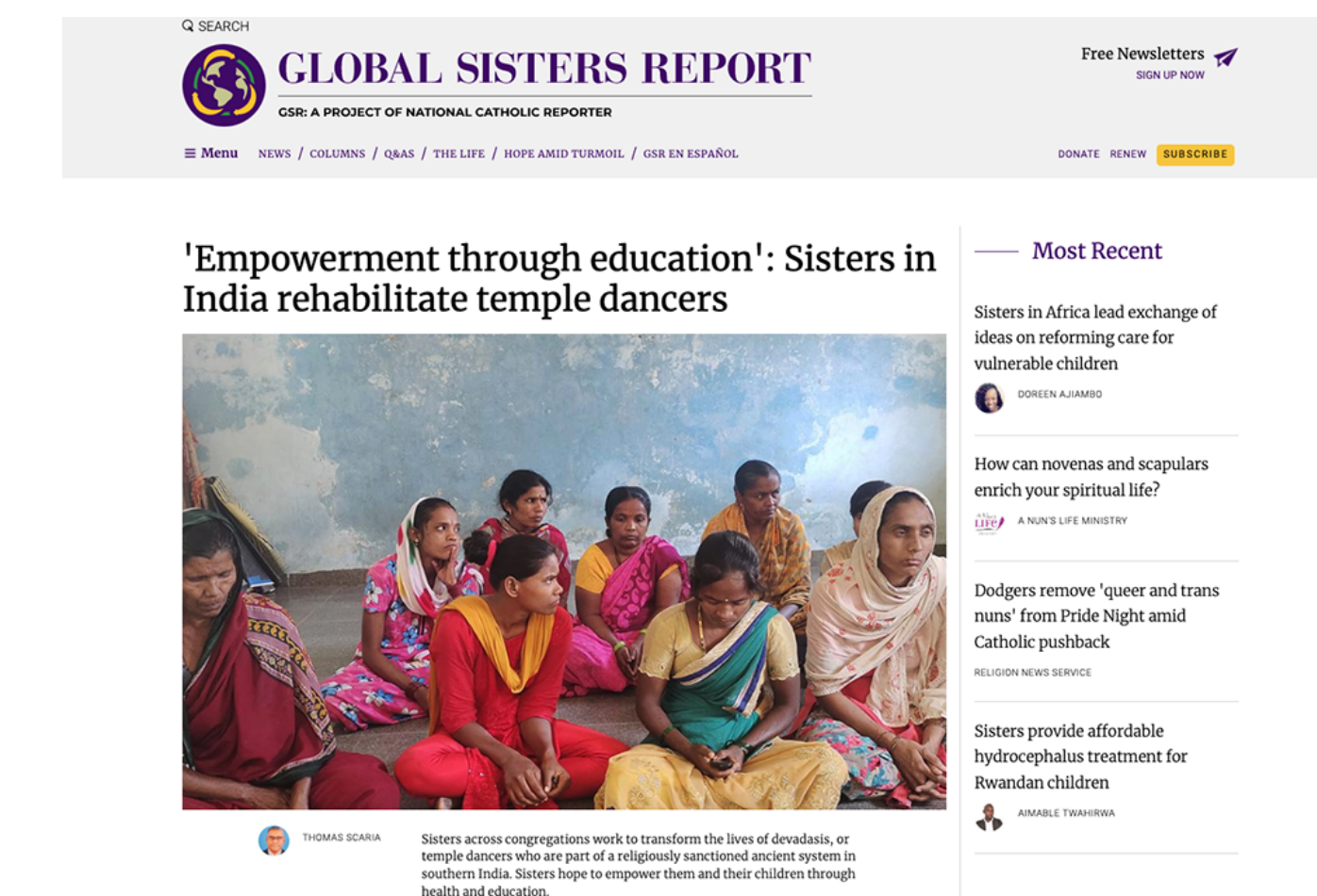
The May 19 homepage of Global Sisters Report

Catholic sisters are not clergy and so they are scarcely "representatives" of the Catholic Church. Moreover, Catholic women religious do more to assist those in marginalized communities than many realize. They do so quietly, and without denigrating others in the process.