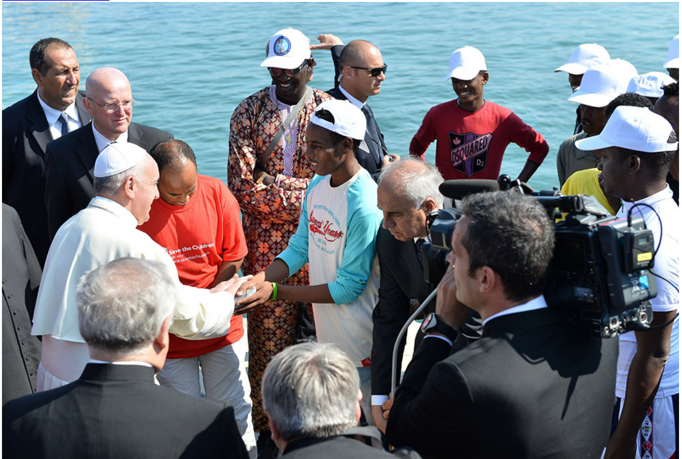
Pope Francis greets immigrants as he arrives at the port in Lampedusa, Italy, July 8, 2013.