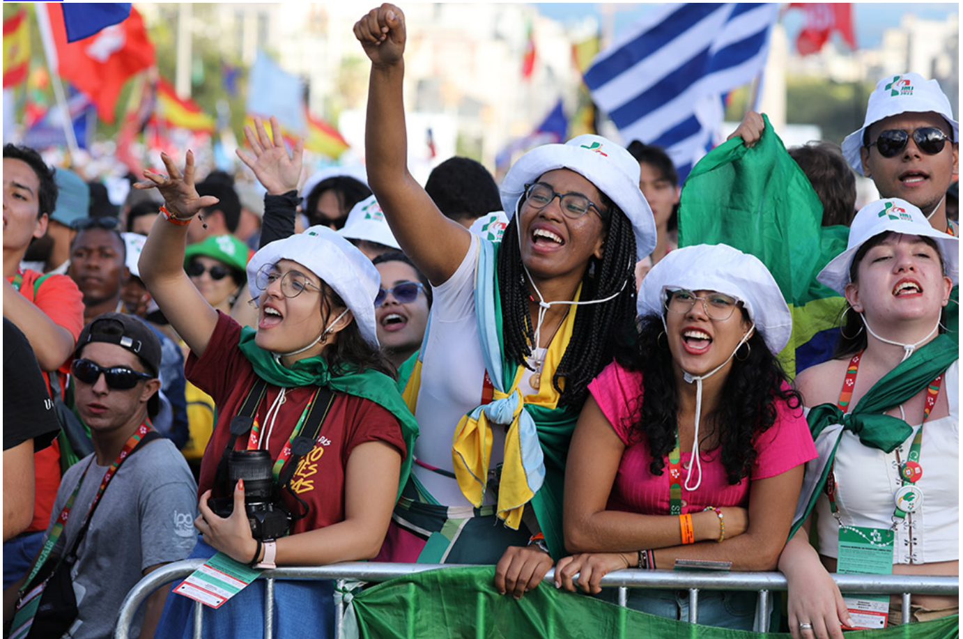
Pilgrims cheer prior to the opening Mass for World Youth Day at Eduardo VII Park in Lisbon, Portugal, Aug. 1, 2023.