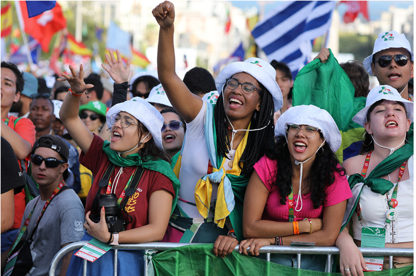
Pilgrims cheer prior to the opening Mass for World Youth Day at Eduardo VII Park in Lisbon, Portugal, Aug. 1, 2023.