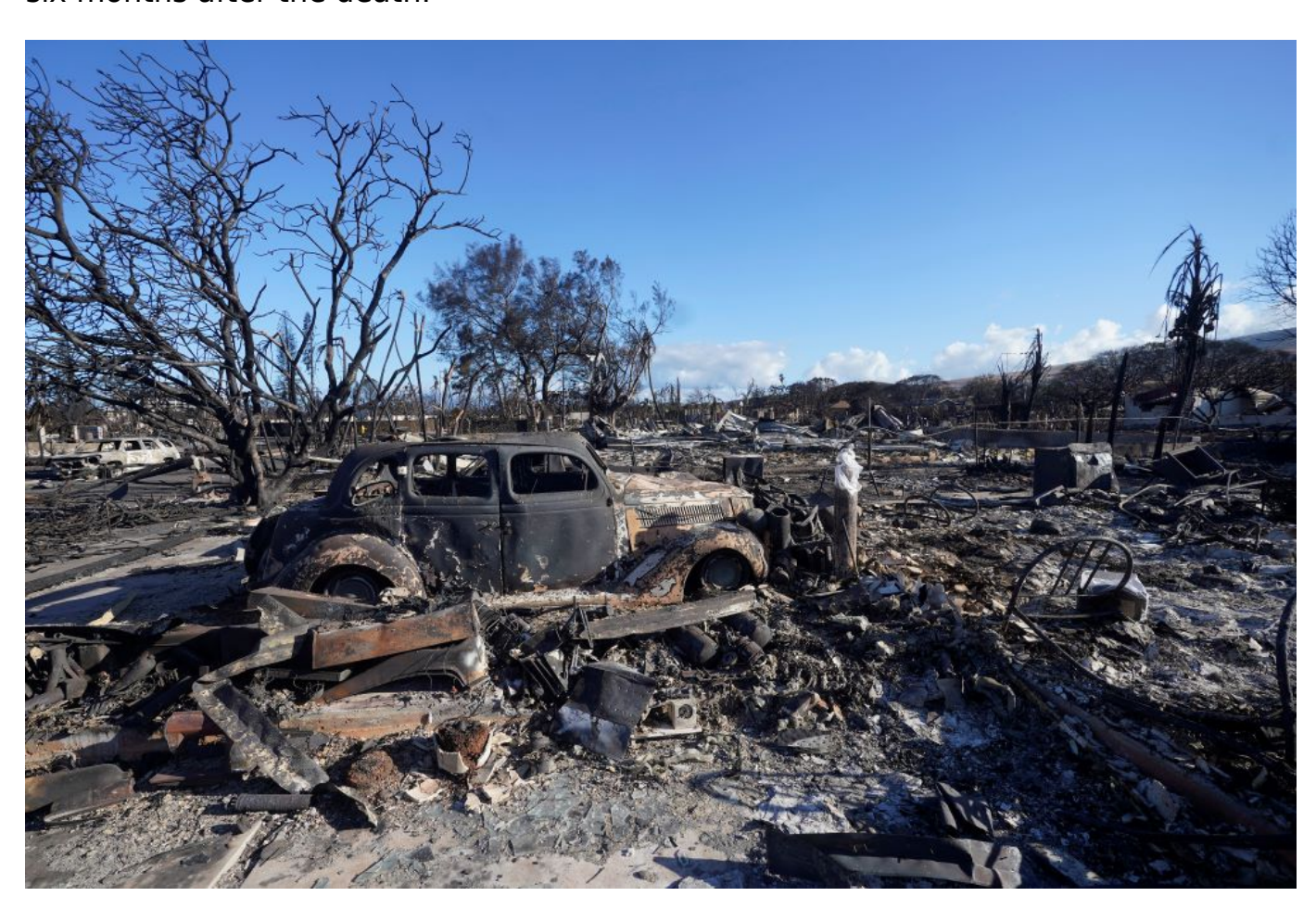
Wildfire damage is shown, Saturday, Aug. 12, 2023, in Lahaina, Hawaii.