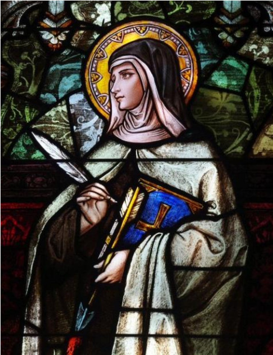
St. Teresa of Avila