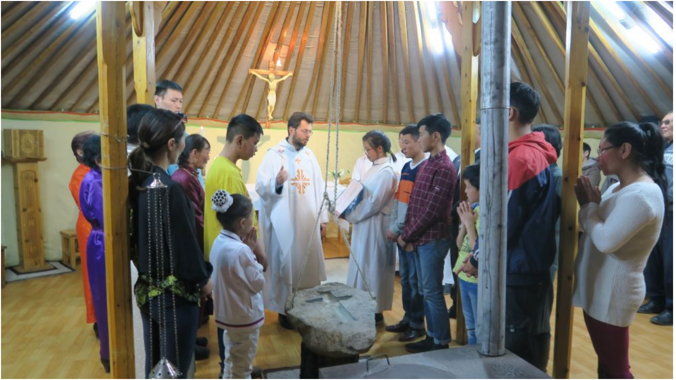
Cardinal Giorgio Marengo, apostolic prefect of Ulaanbaatar, Mongolia, center, is pictured celebrating Mass in a March 31, 2018, file photo. Mongolia's Catholic community is one of the world's smallest.