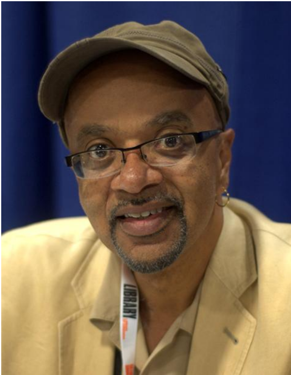
James McBride, author of The Heaven & Earth Grocery Store

After all, the title of McBride's best-selling debut memoir, The Color of Water — about his sprawling, biracial, Christian and Jewish, Northern and Southern family — comes from his mother's response when young James asks "whether God was black or white." And McBride's second book, the World War II novel Miracle at St. Anna , is set in motion by an object resting on a table as if "God had placed it there, which He, in fact, had."