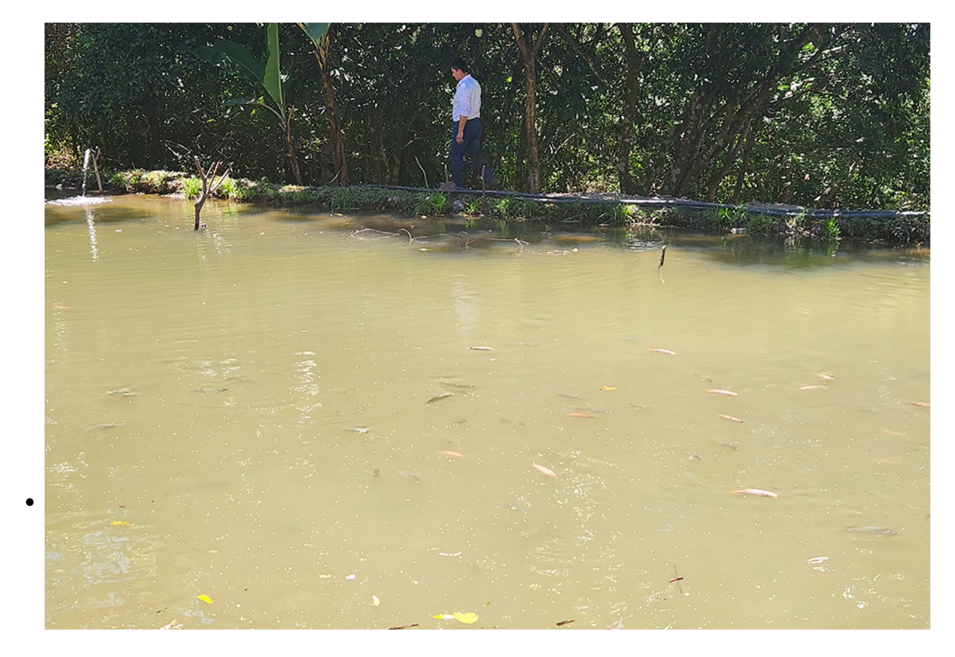
A pond on the property of Rony Figueroa holds 3,000 tilapia, which provide an additional source of income for the family farmer in central Honduras.

"You need clothes, you need food and all of that. There's no employment sources, so people migrate," Figueroa said.