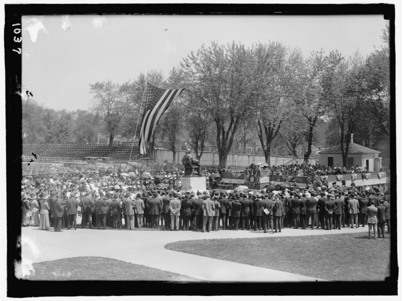
A photo of the May 4, 1912, dedication of the John Carroll statue at Georgetown University.