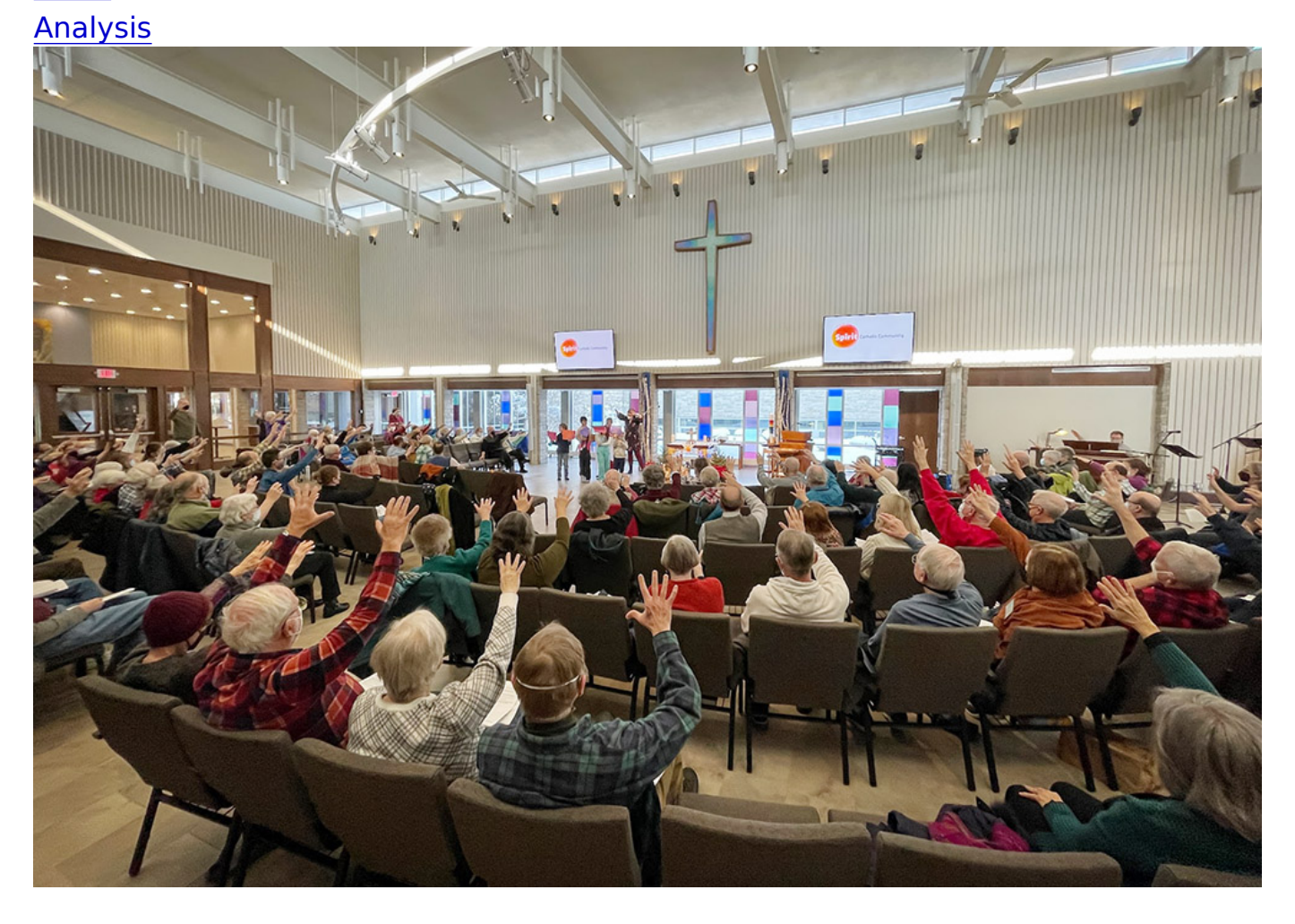
Spirit Catholic Community in Minneapolis blesses children and families baptized on Epiphany in 2023.