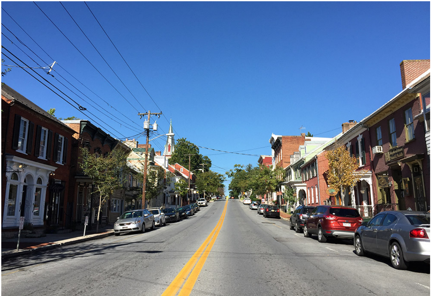
View of a street in Shepherdstown, West Virginia