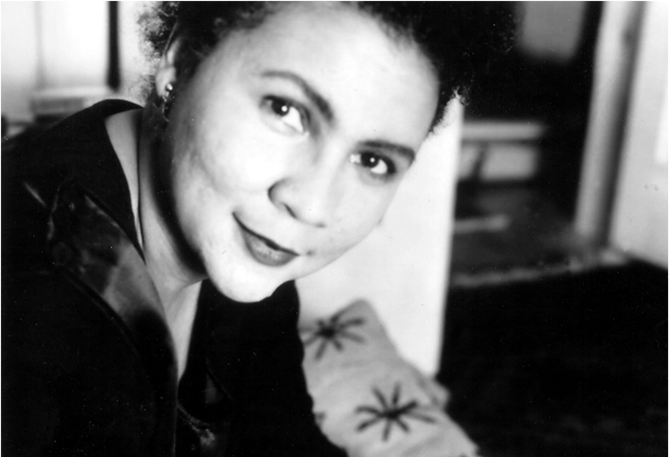
Author and social activist bell hooks

she coined — 'imperialist white supremacist capitalist patriarchy' — captured the interlocking forms of oppression that target them."