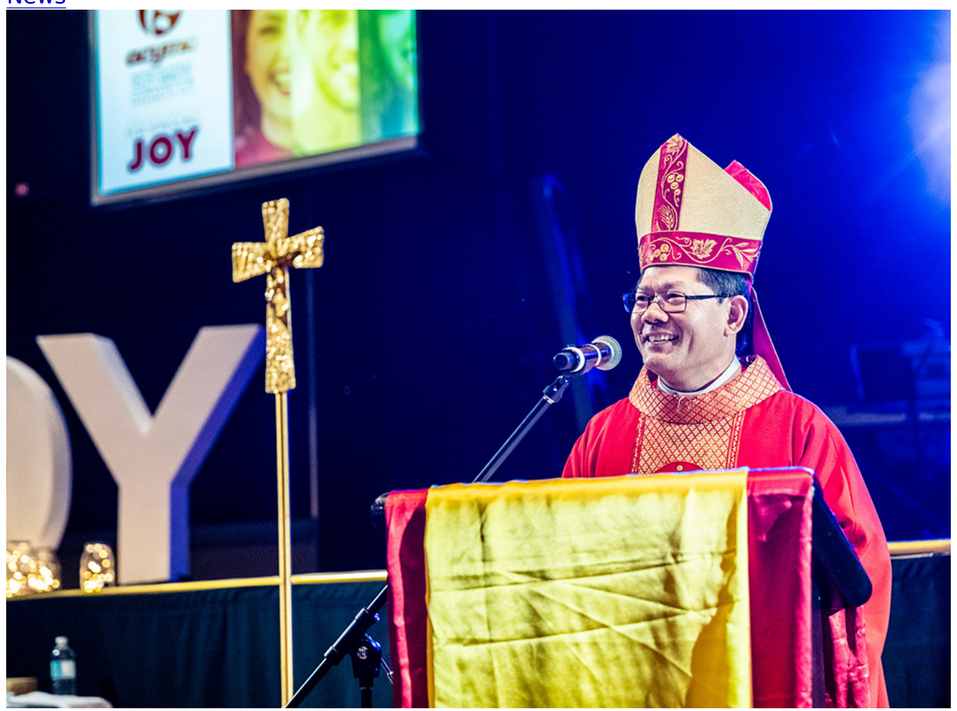
Bishop Vincent Long of Parramatta, Australia