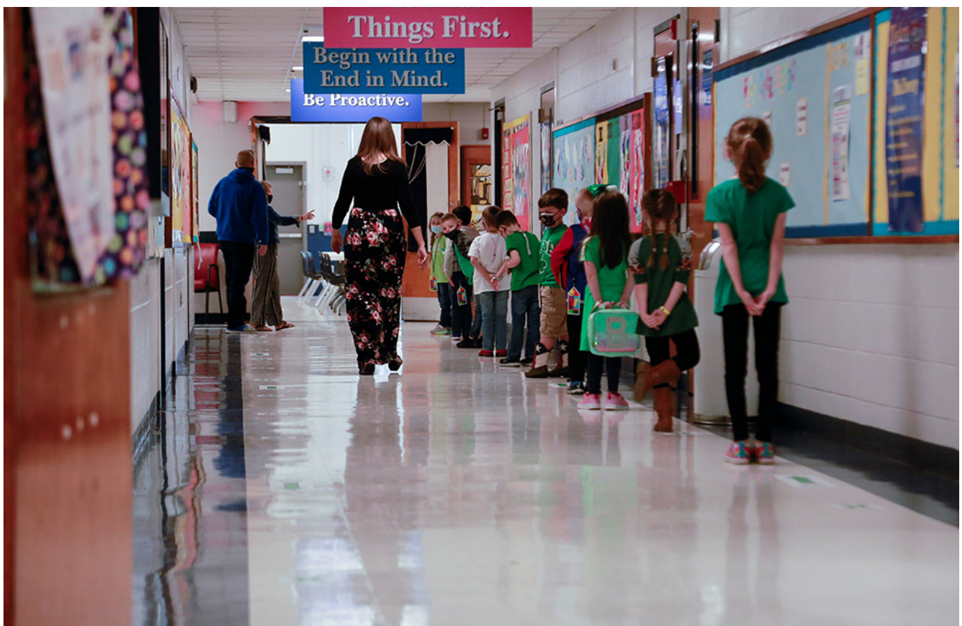
Students in Louisville, Kentucky, practice social distancing on the first day back to school March 17, 2021, after COVID-19 restrictions were adjusted.

We are here as survivors of a global pandemic that some in our midst still deny even happened. We are survivors of a global pandemic even though some of our population refused to sacrifice their personal convenience for the common good. We are still here because of leadership in the commonwealth that urged us to remember that we were all in the same circumstances and needed to care for and watch out for each other.