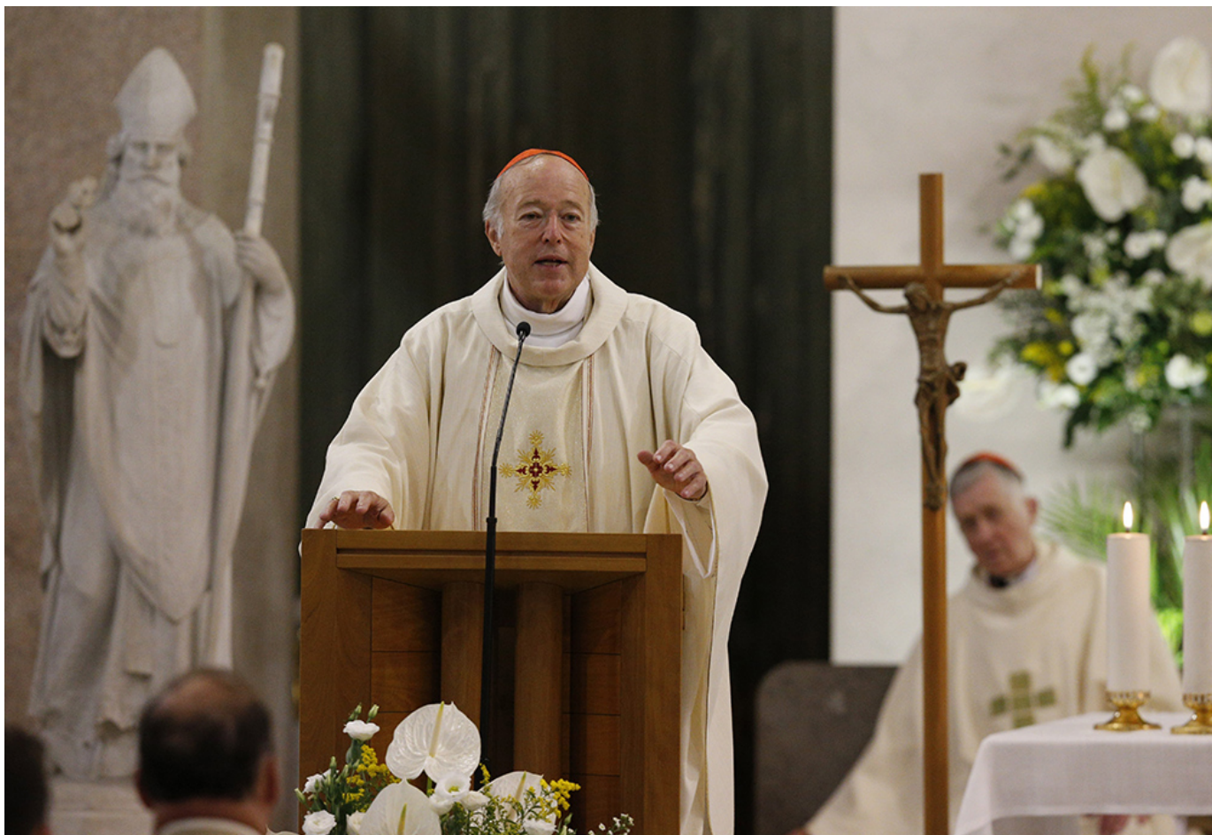
Cardinal Robert McElroy of San Diego gives the homily as he celebrates a Mass of thanksgiving at St. Patrick's Church in Rome in this Aug. 28, 2022, file photo.