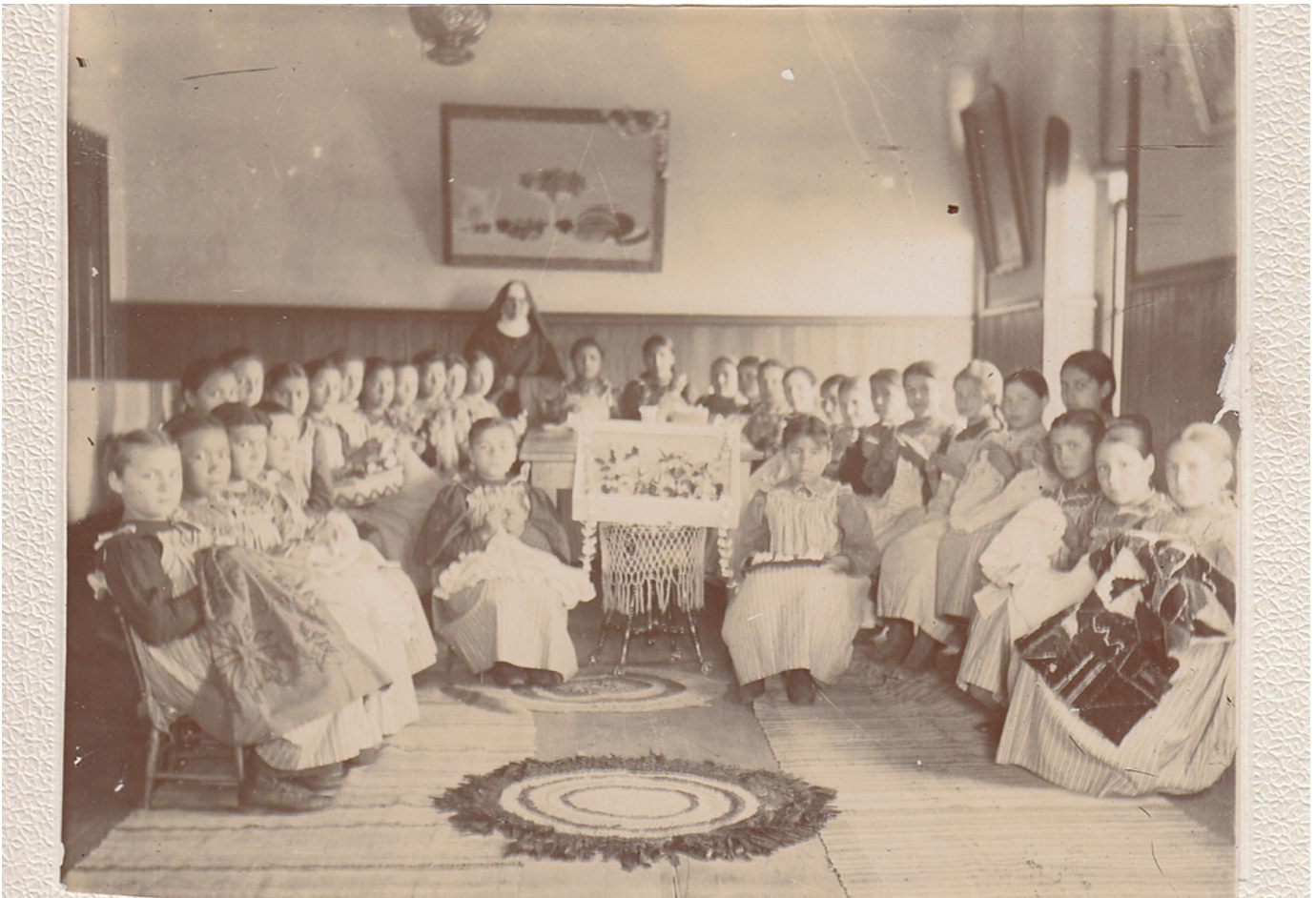
Female students show their handiwork at St. Benedict's Mission School on the White Earth Indian Reservation in Minnesota in the 1890s.

The series continued with a deeper look at the steps being taken toward reconciliation as recommended by the Truth and Reconciliation Commission and a closer look at Returning to Spirit , an Indigenous-led, not-for-profit group that was co-founded by the Sisters of St. Ann.