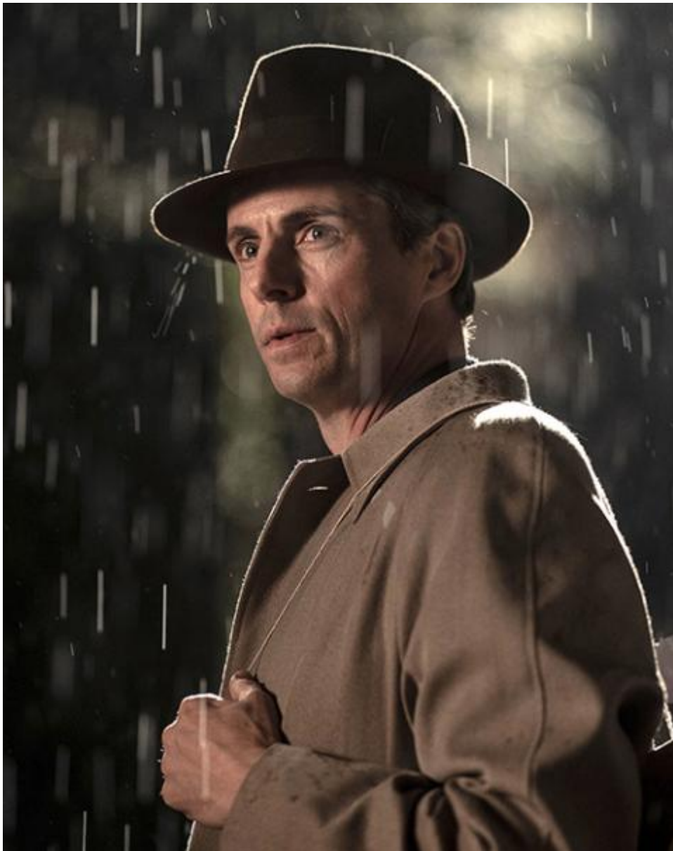
Matthew Goode as C.S. Lewis in "Freud's Last Session"

And so, as Lewis lingers in Freud's home, witnessing the doctor's slow decline from oral cancer, he can't help but care for him. He walks his dog and retrieves fresh handkerchiefs. He accompanies the doctor — and Freud allows it. Despite the clear defenses around so much of his life, in this simple, quiet moment when the world was at war, Freud allows Lewis in.