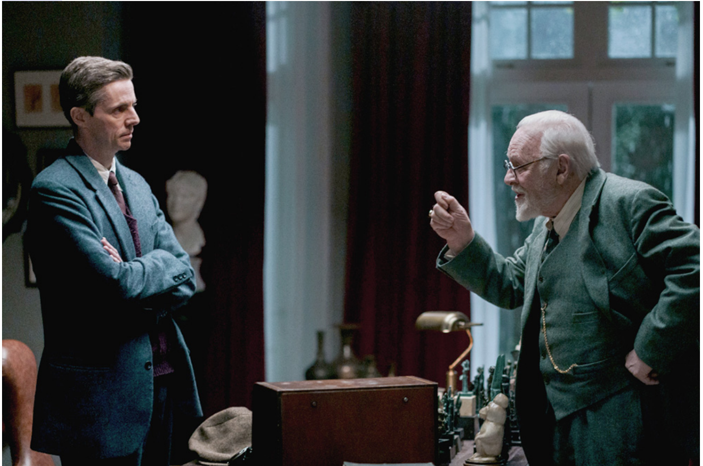
Matthew Goode as C.S. Lewis (left) and Anthony Hopkins as Sigmund Freud in the film "Freud's Last Session"