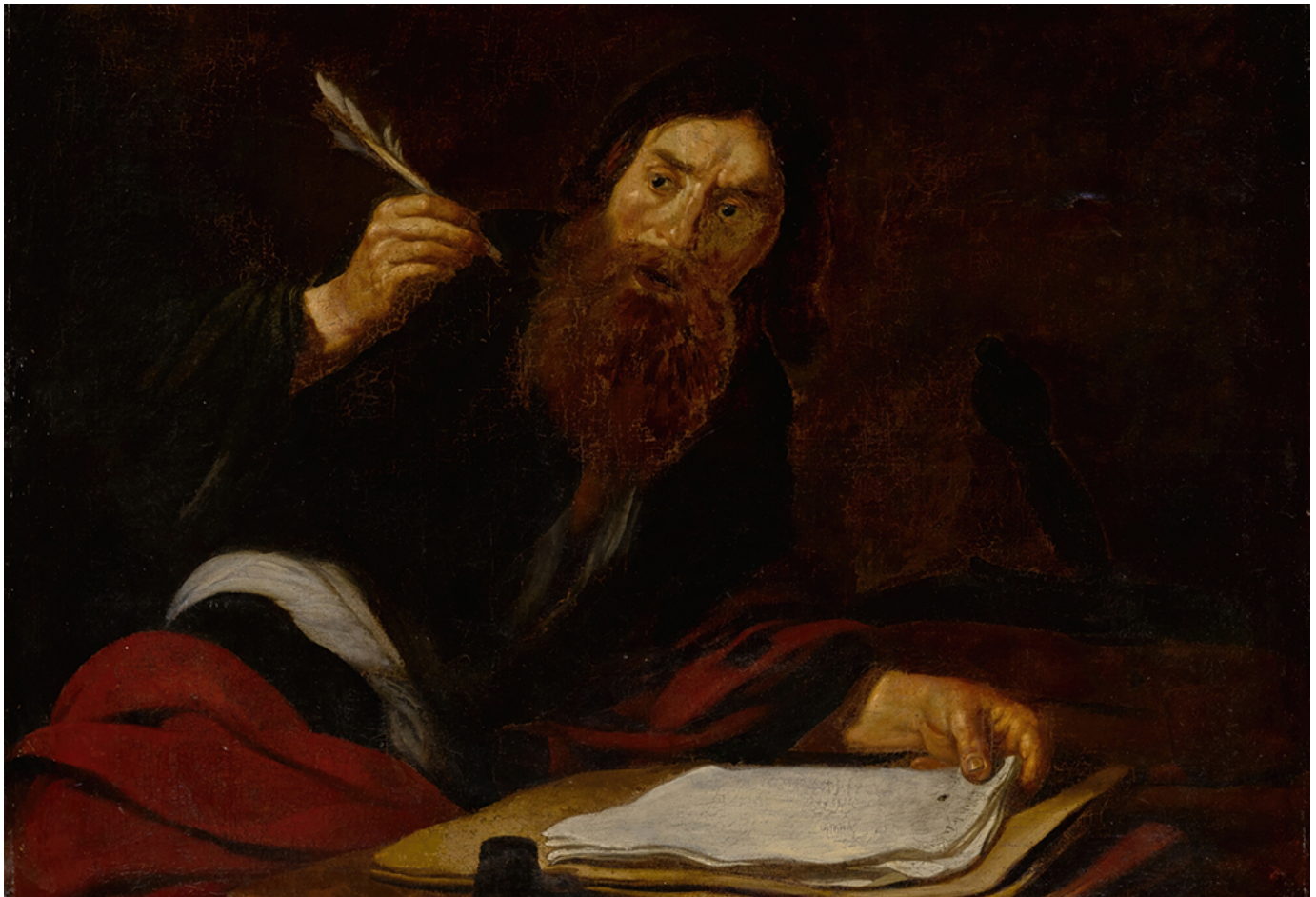
"St. Paul writing at his desk" by French artist Claude Vignon

In What to Believe? you open with a chapter titled " 'God' Does Not Exist" and talk about "theological atheism." Quickly the reader realizes that you're not denying the reality of the divine or transcendent per se, so how do you mean such a (seemingly) bold statement?