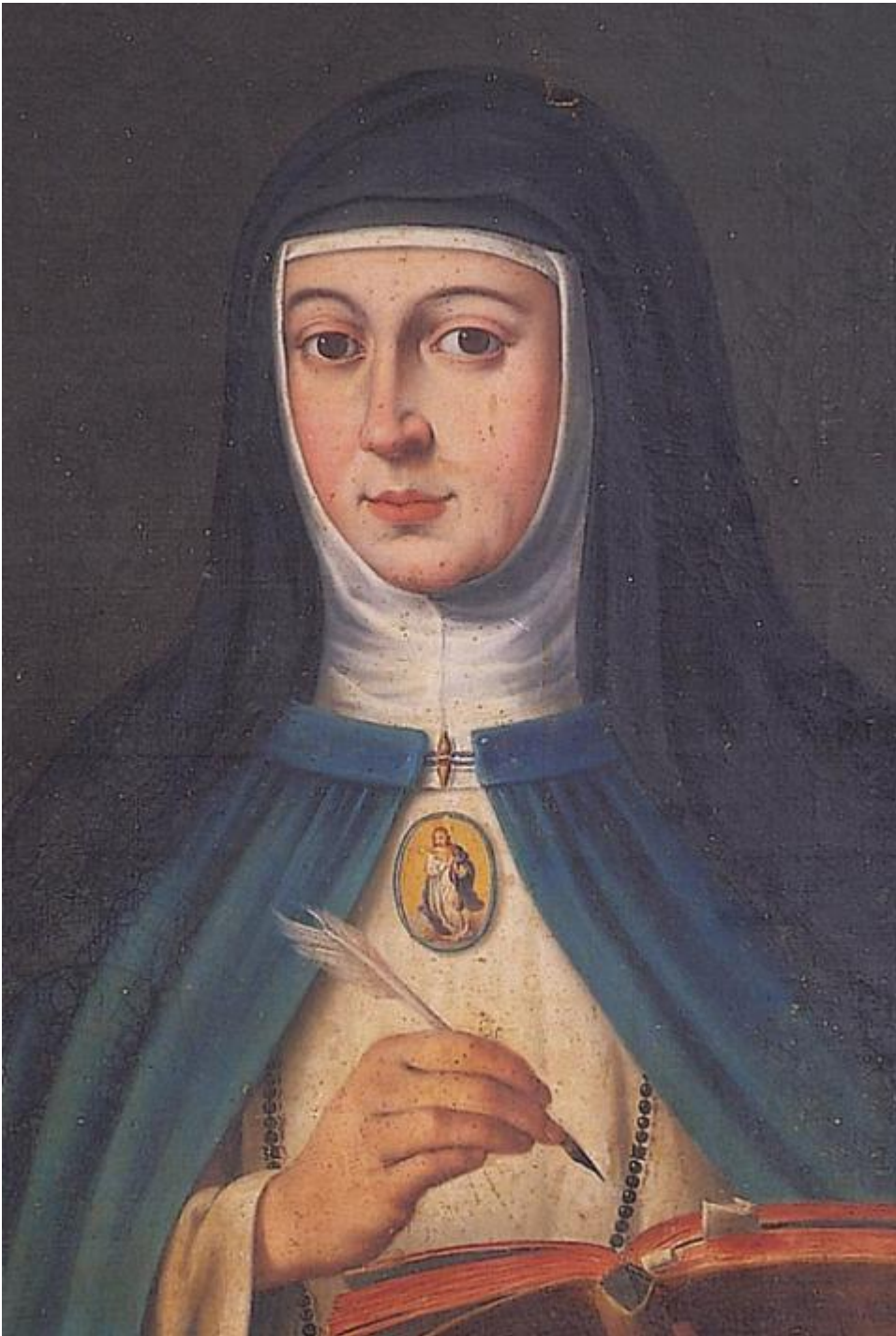
Detail of an undated portrait of Sor María de Ágreda

Masseo was a witness, but also a participant. Shortly after Francis ordered him to yield, Masseo obediently fell into his arms and was soon set aloft by the power of the saint's own breath.