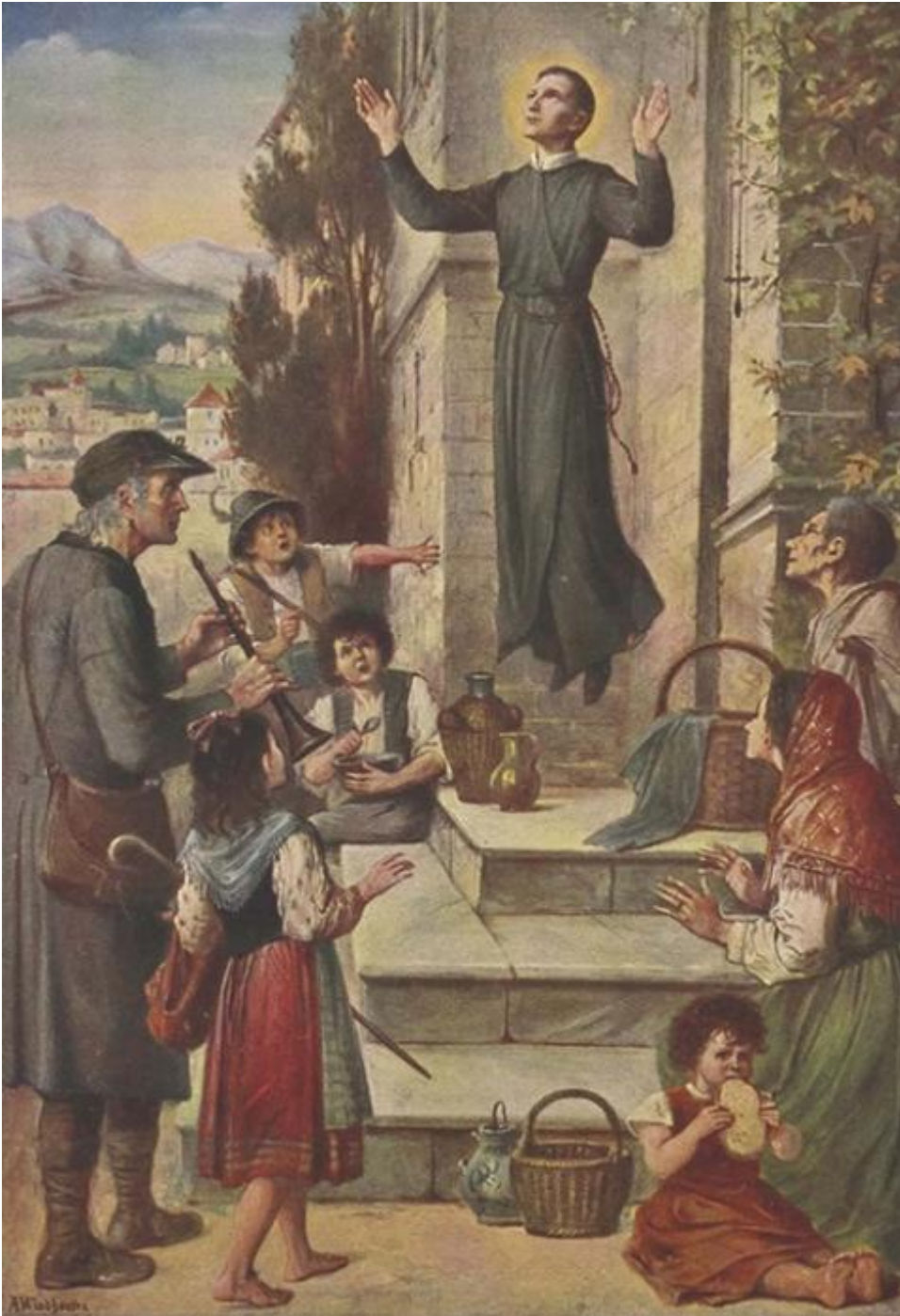
A 1918 illustration of St. Gerard Majella

The canonization records of St. Birgit of Sweden mention several astonished onlookers who saw her take wing. In Raymond of Capua's life of St. Catherine of Siena, we are told a story about Catherine's experience as a young girl enjoying being carried off the ground. "As a fish enters the water and water enters it," he wrote, "so her soul entered into God and God into it."