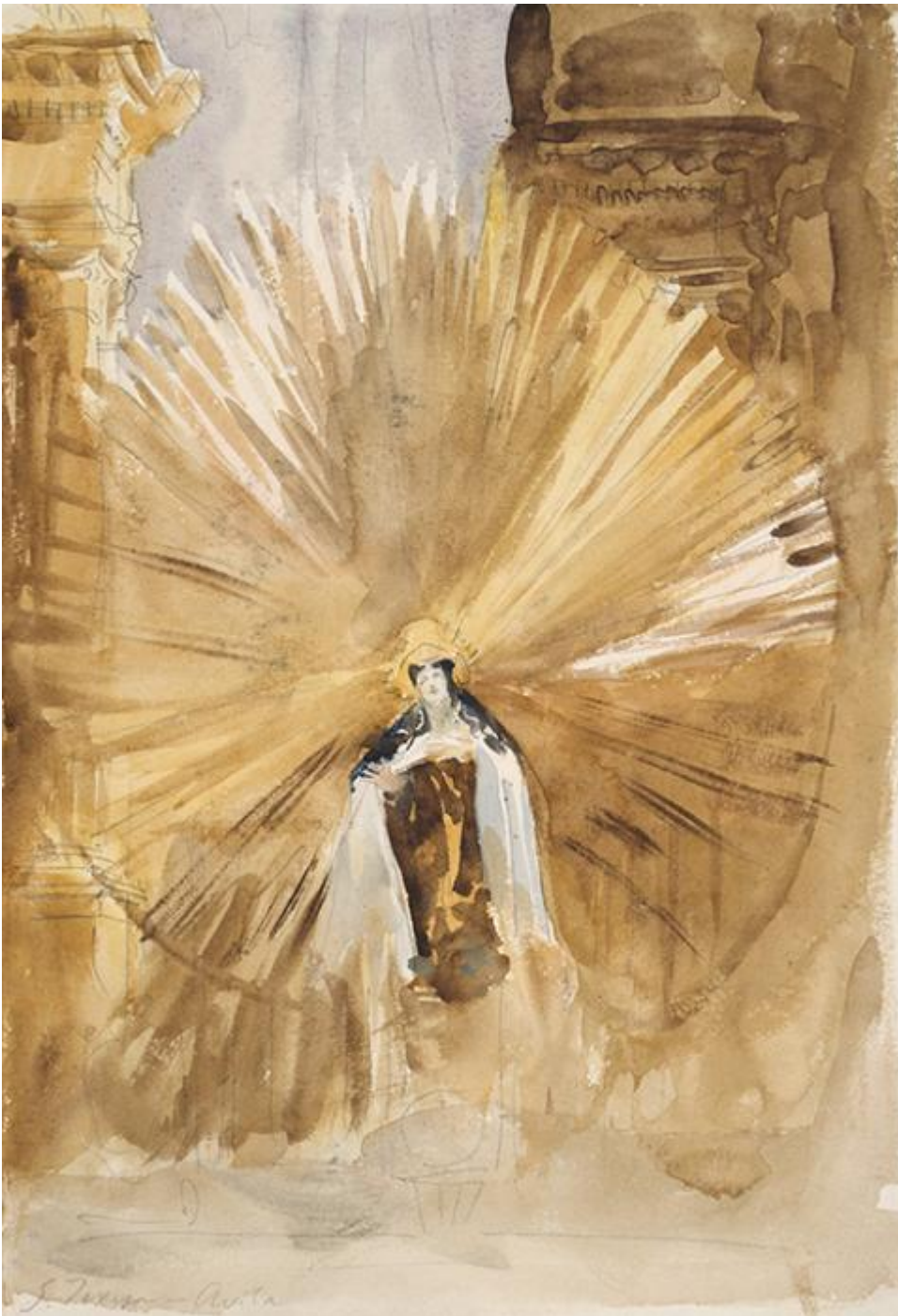
St. Teresa of Ávila in a circa-1903 watercolor by John Singer Sargent