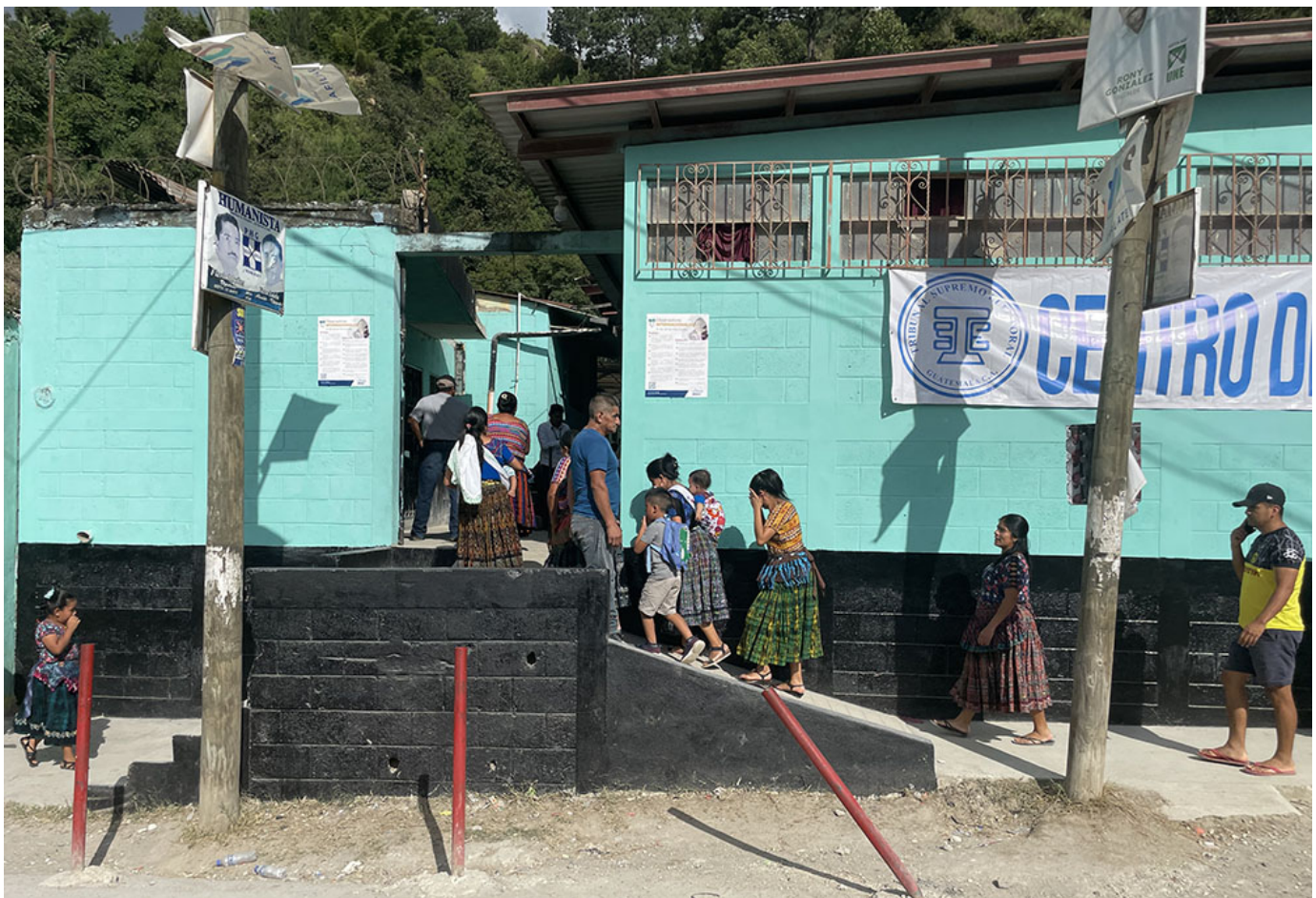
Families enter a voting center in Chinautla, on the edge of Guatemala City, in mid-August.

The United States, supportive of the new president and the initiatives to shore up democracy as well as human rights, seems prepared to finally do something right by Guatemala.