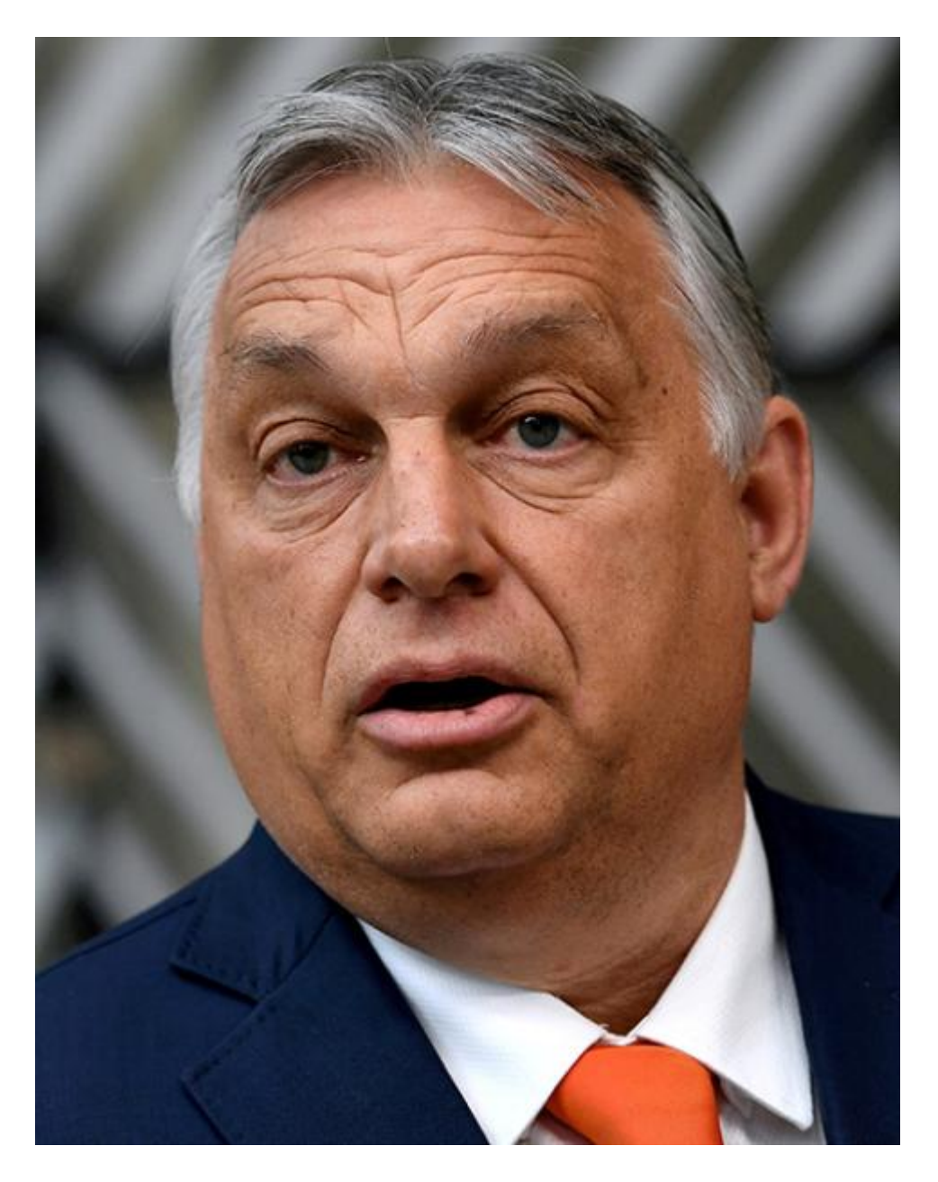
Hungarian Prime Minister Viktor Orbán during the European Union summit in Brussels June 24, 2021

A combination of factors, from the migration crisis to suspicion of secular Western elites to high youth unemployment, brought right-wing nationalist Viktor Orbán to power in 2010, but he did not start by invoking religious ideals. Orbán's appeal was more racist and populist than religious, in part because Hungary has some of the lowest church attendance numbers in Europe. Its historic antisemitism was considered just that, historic.