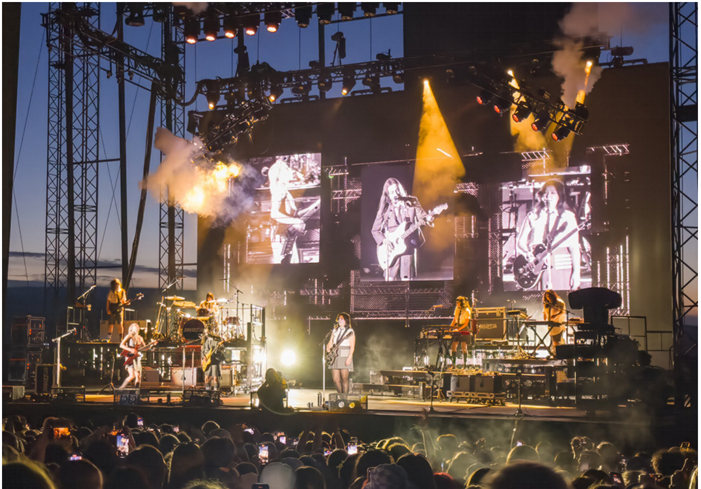
Boygenius performs live in July 2023, the hottest month ever recorded

Maybe it was the heat cooking my brain, or that despite a recent school shooting, Gov. Lee could only talk about how drag queens were the most dangerous thing facing Tennessee's children; or maybe it was that the Nashville Parthenon felt like a portrait of our country, an empire that daily feels more like a facade. A roadside attraction. Whatever was to blame, I found myself overcome with the sense that we are all languishing. We're living at the end of something, it seems; the end of an empire, capitalism or maybe the planet itself.