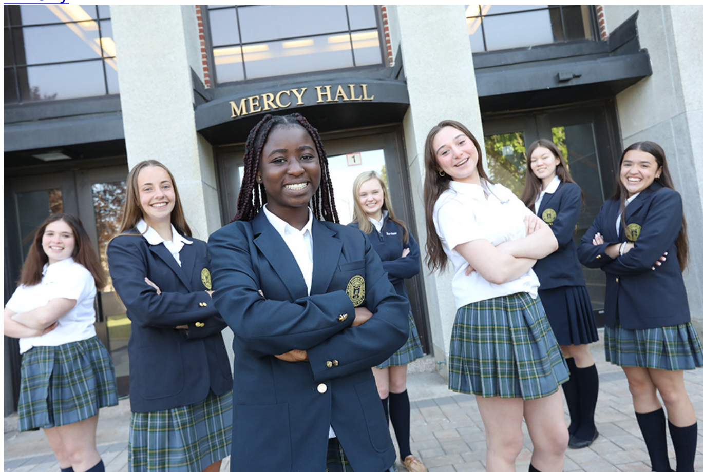
Students at St. Mary Academy - Bay View in East Providence, Rhode Island