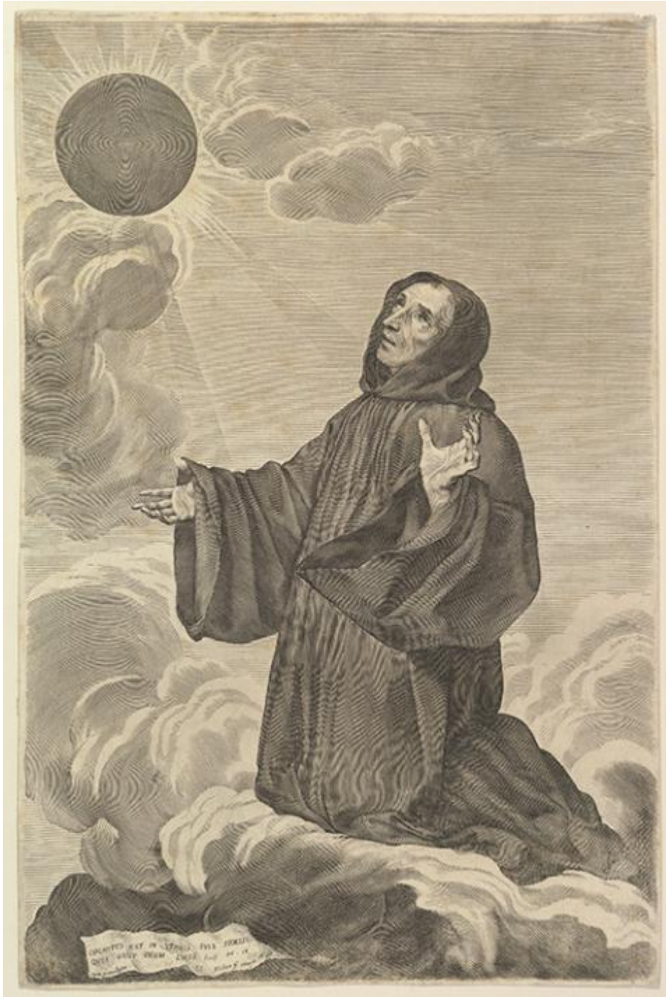
"St. Benedict in Ecstasy," by Claude Mellan (Metropolitan Museum of Art)

As I returned to work after my trip, I was faced with a question: What will benefit my students? Is it me trying to make a difference in their lives by coming up with the perfect lesson, the perfect solution to their problems? Or is it me "obeying" reality in the Benedictine sense — paying more attention to them and less to the little details of planning my lessons?