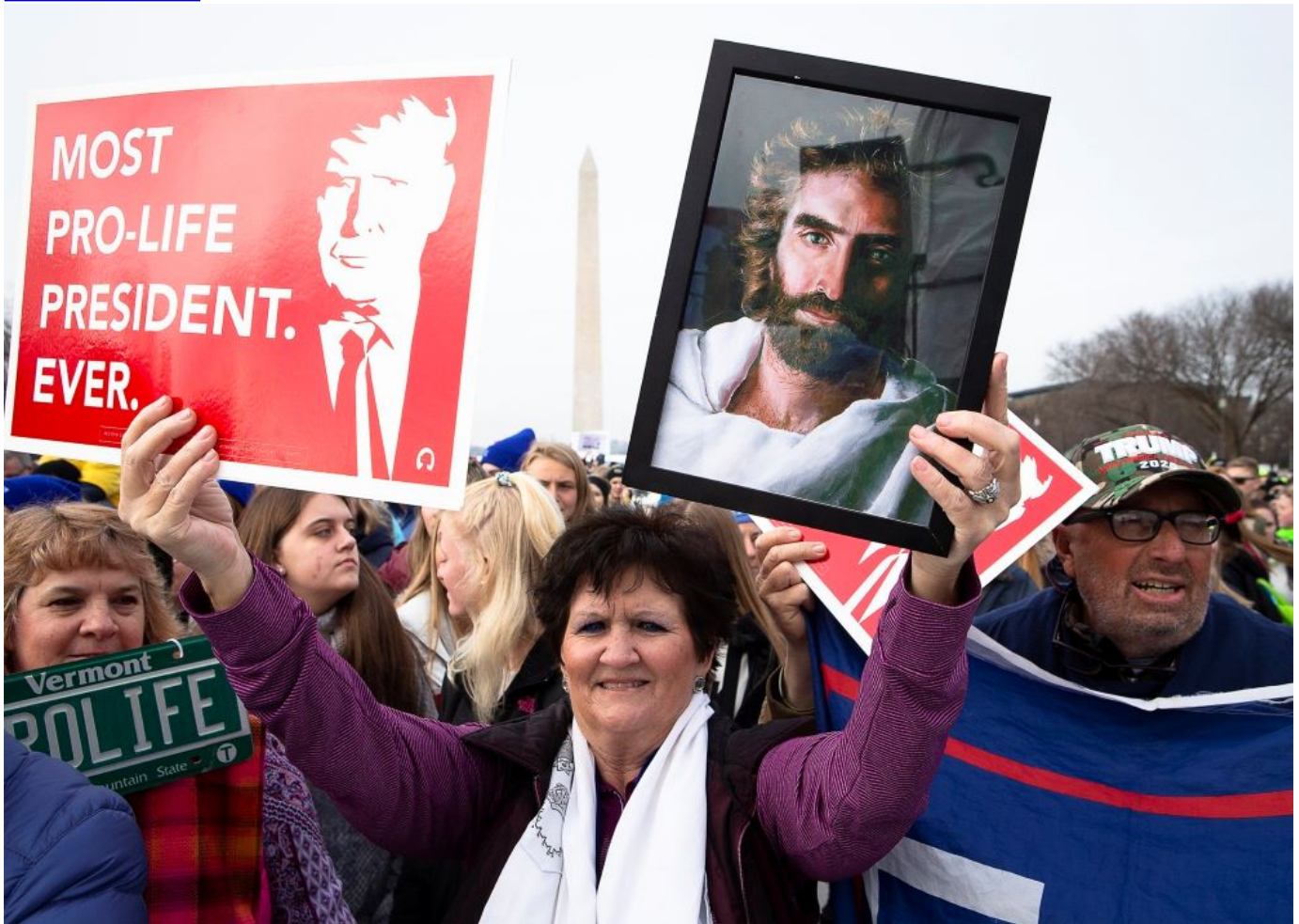
A woman holds an image of Jesus and a poster about President Donald J. Trump during the annual March for Life rally in Washington Jan. 24, 2020.