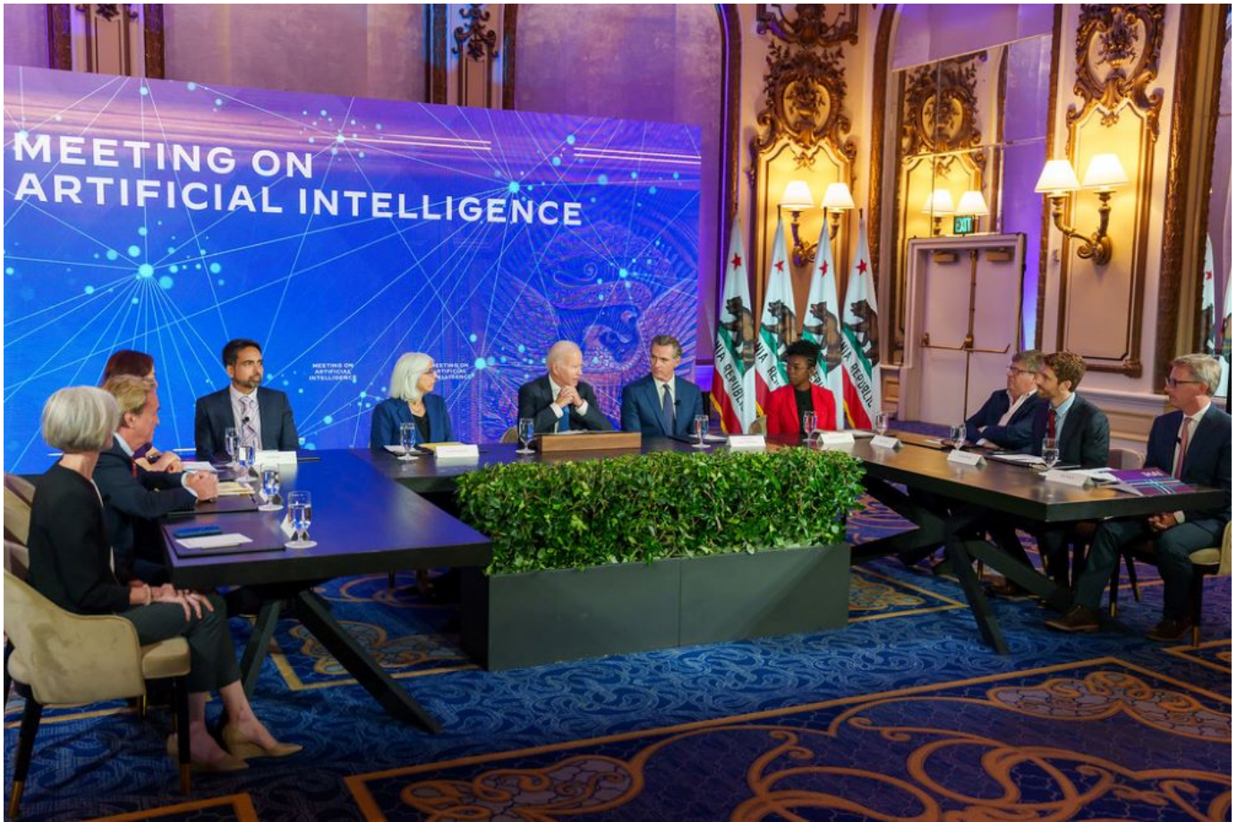
President Joe Biden hosts a meeting on artificial intelligence June 20, 2023, at The Fairmont hotel in San Francisco.

Hard questions need to be asked when developing them: "What will it accomplish?" and "What are the risks?" Technologists cannot answer these alone, for "the specialization ... makes it difficult to see the larger picture." They might insist that they seek to "save humanity" and to construct an AI that's "aligned" with humanity's goals. But just what are those goals, and what are we being saved from, or for?