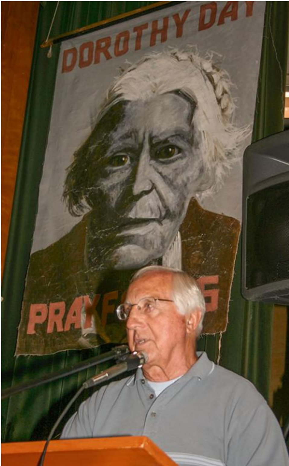
Bishop Thomas Gumbleton speaks at the Catholic Worker movement's 75th anniversary celebration at Our Lady of Mount Carmel-St. Ann Church and Parish Center in Worcester, Massachusetts, July 10, 2008.