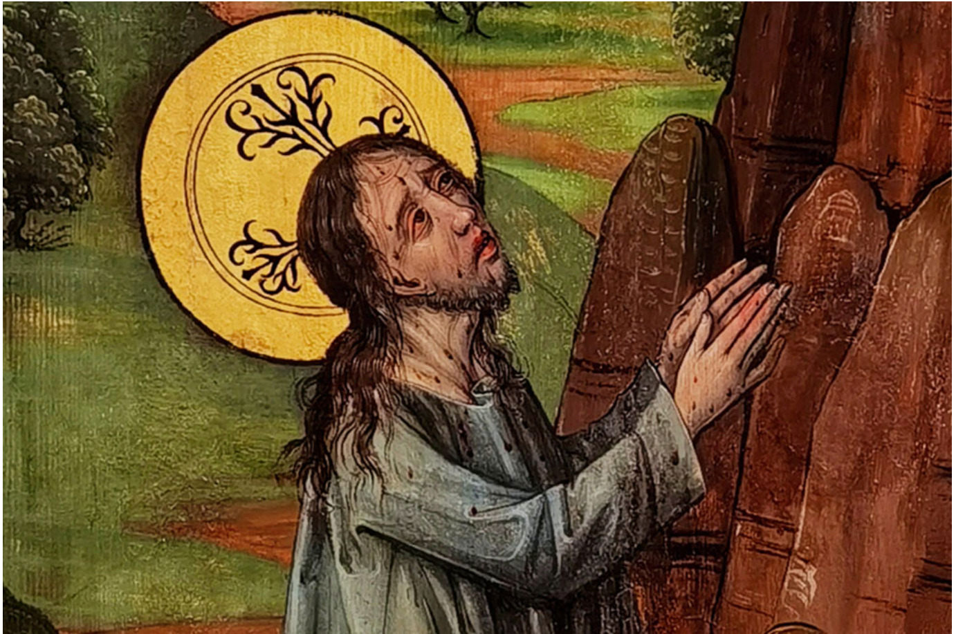
Detail from a 15th-century German altarpiece depicting the Agony in the Garden

The bovine nature of Jesus' salvific power was something Black Elk saw in his visions before his Catholic baptism. In his Great Vision of the Sacred Tree when he was 9 years old, he saw a red man roll in the earth and become a buffalo, then roll again and become sacred medicine.