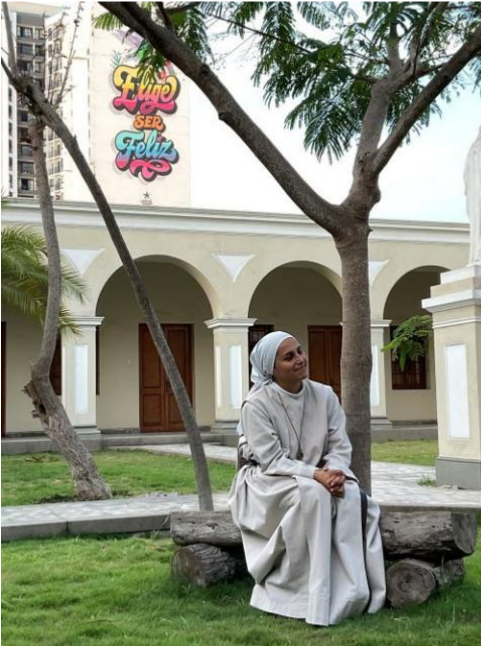
A sister prays in the cloister of the Monastery of the Incarnation in Lima, Peru.

our own way of understanding existence, to each his own. It is possible to live with the sole pretension of fulfilling oneself, of gaining well-being or power or fame; or to live in pursuit of the comfort of a life with few surprises and, at the same time, with some emotions that embellish it.