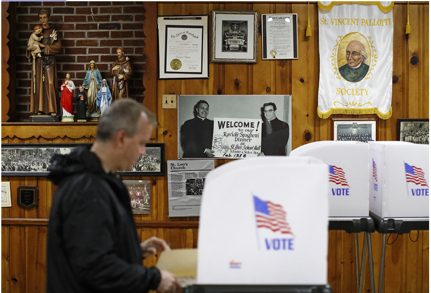
Religious artwork and vintage photographs adorn a wall behind a voter as he completes his ballot at a polling place inside St. Leo the Great Roman Catholic Church, Nov. 6, 2018, in Baltimore.