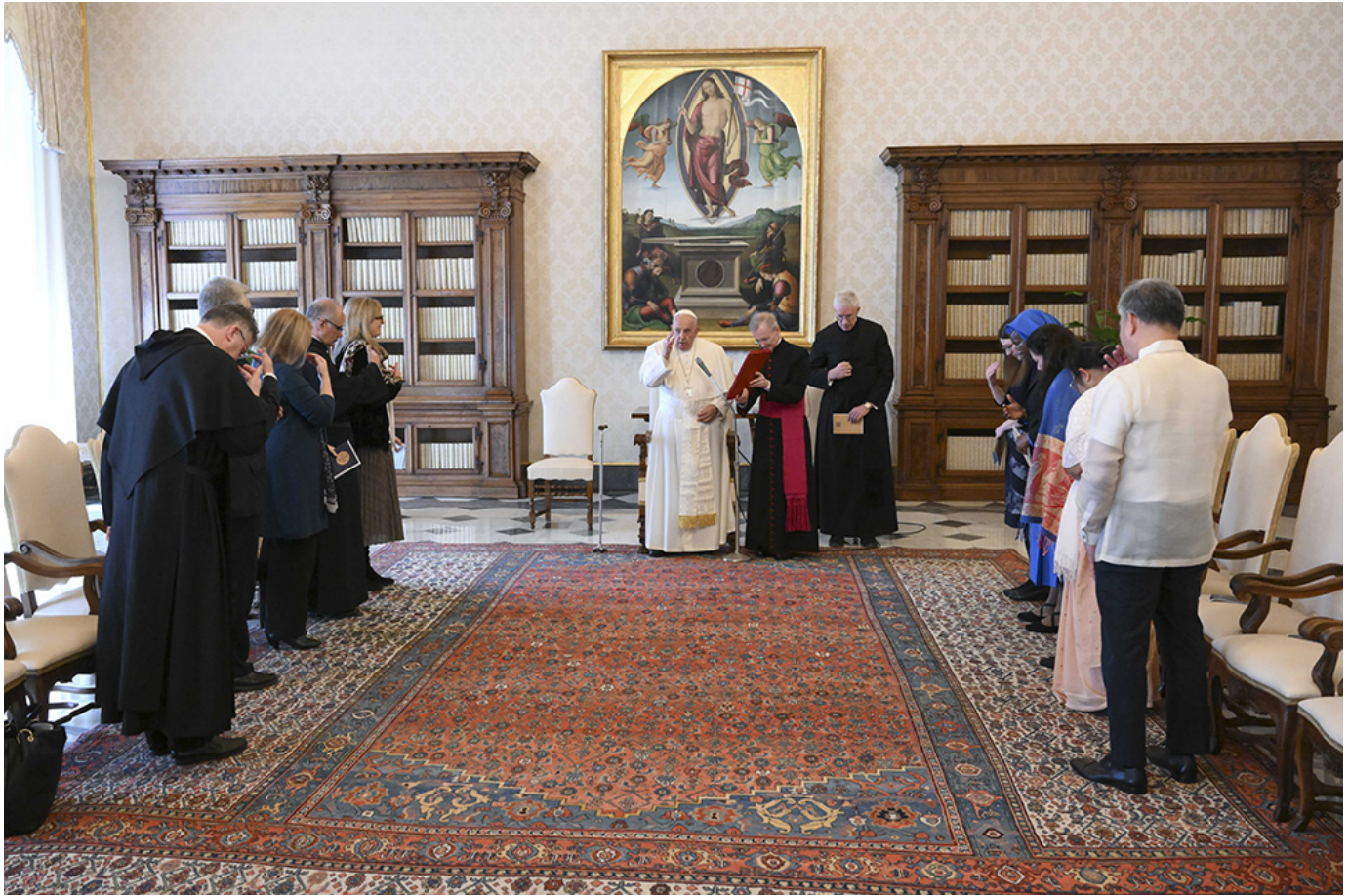
Pope Francis prays with members of the International Network of Societies for Catholic Theology in the library of the Apostolic Palace at the Vatican May 10, 2024.