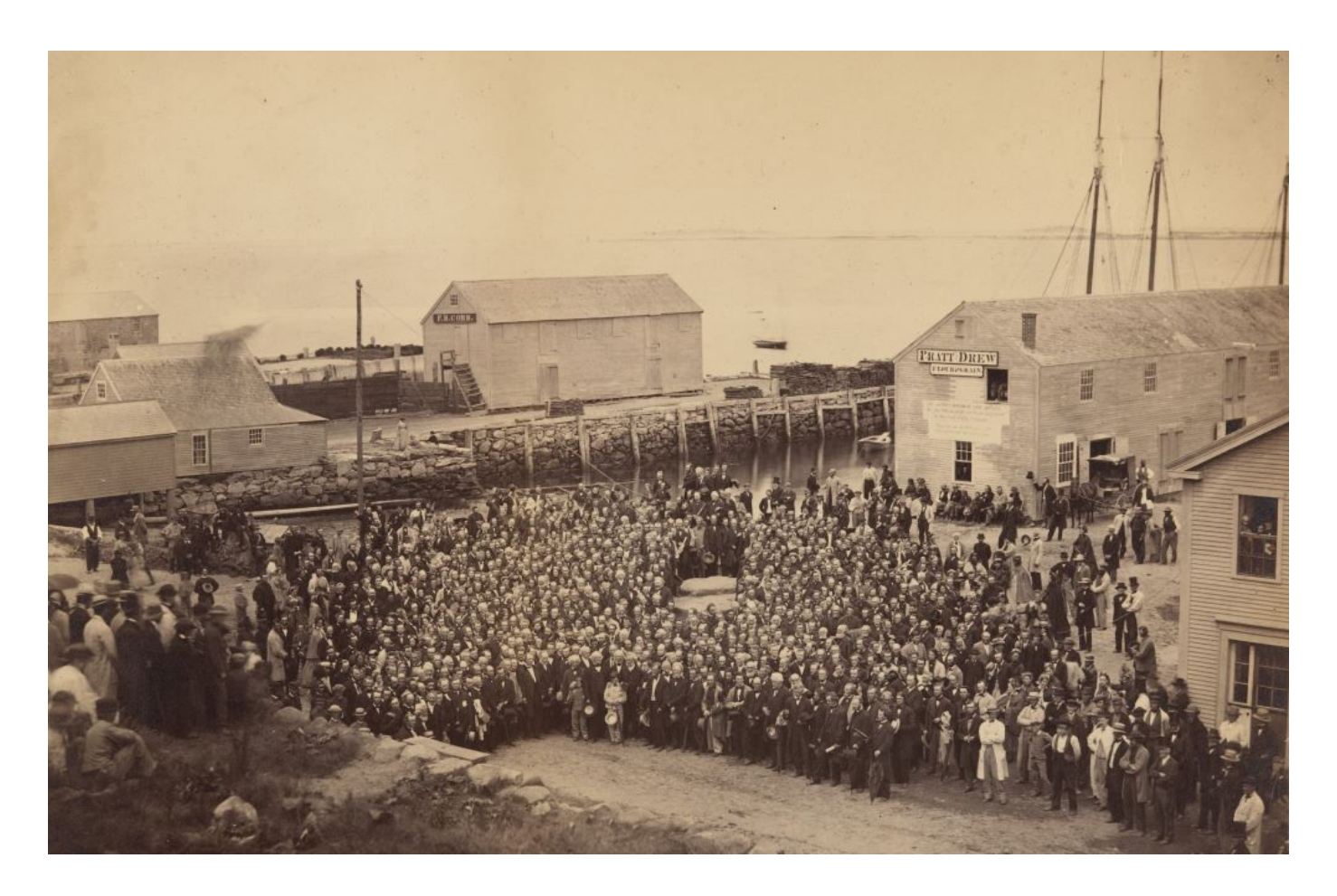
A June 22, 1865, photograph by John Adams Whipple shows the National Congregational Council at Plymouth Rock. (Metropolitan Museum of Art)