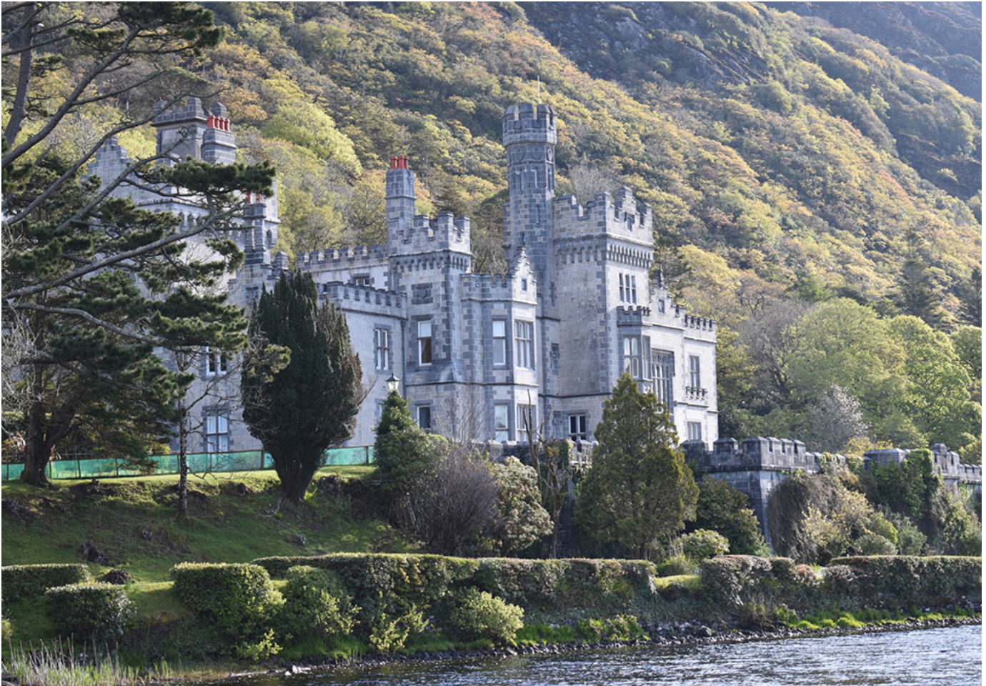
Kylemore Abbey in Connemara, Ireland