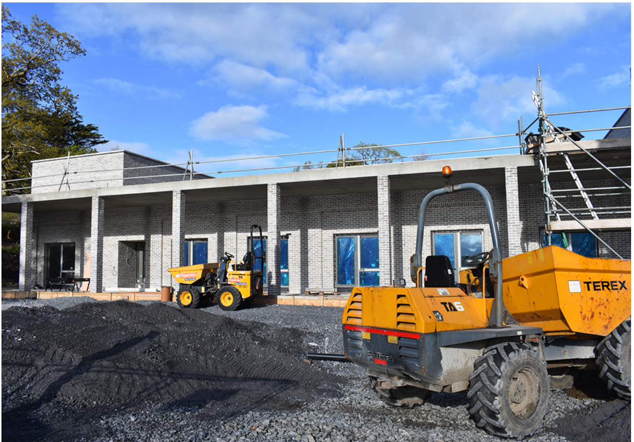
Equipment is visible on what will be the public side of the new monastery at Kylemore Abbey in the final weeks of construction.