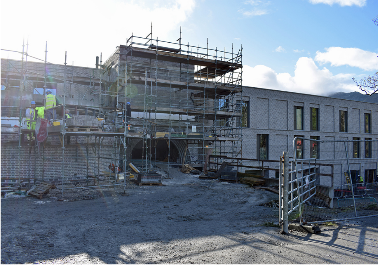
Workmen and scaffolding are still visible near the arched monastic entrance to the new monastery at Kylemore Abbey in the final weeks of construction. (Julie A. Ferraro)