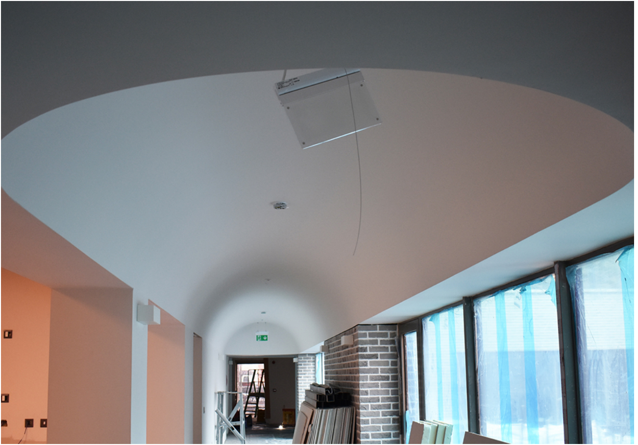
Vaulted ceilings along the corridors of Kylemore's new monastery challenged the plasterers creating the interior spaces.