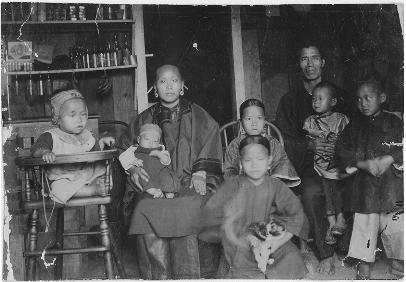
A Chinese family in Honolulu, Hawaii, in 1893. In much of the U.S., immigrants from Asia experienced intense discrimination.

Generally speaking, racial rather than religious prejudice dominated anti-immigrant politics by the late 19th century — although these boundaries blurred in the case of antisemitism against Jewish immigrants from eastern and central Europe. The popularity of "racial Darwinism" was at its height: pseudoscientific thinking that misconstrued Charles Darwin's ideas about evolution, applying ideas such as " survival of fittest " to human society. Many Americans with ancestry from northern Europe embraced the resulting dogma of "Nordic" superiority.