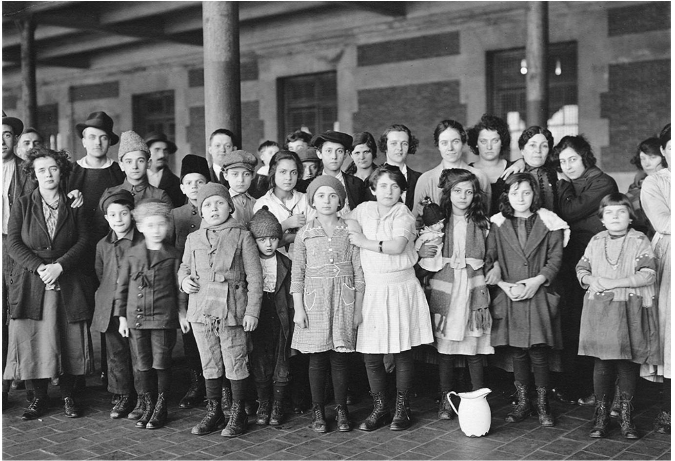
Immigrant children at Ellis Island in New York, 1908