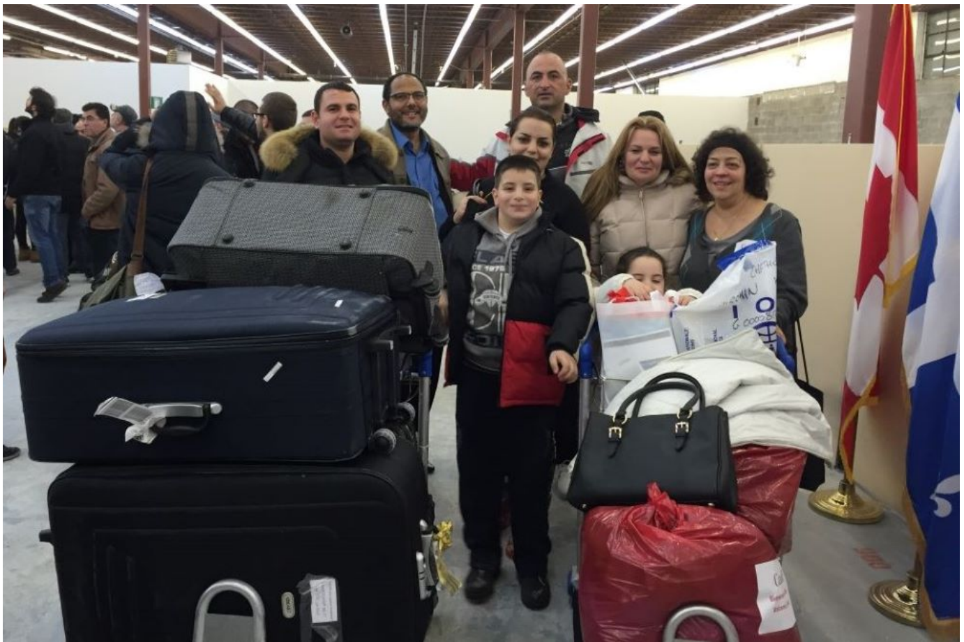
Families arrive at the Refugee Reception Center during the arrival of many Syrian families sponsored by the Franciscan Oblates of St. Joseph 2015-2016.

The sisters are also dedicated to helping refugees integrate socially by organizing birthday parties, Christmas celebrations and trips to Quebec, or to visit the sanctuary in Cap-de-la-Madeleine . Finally, they also organize formation sessions about legislation in Quebec to help refugees familiarize themselves with the law.