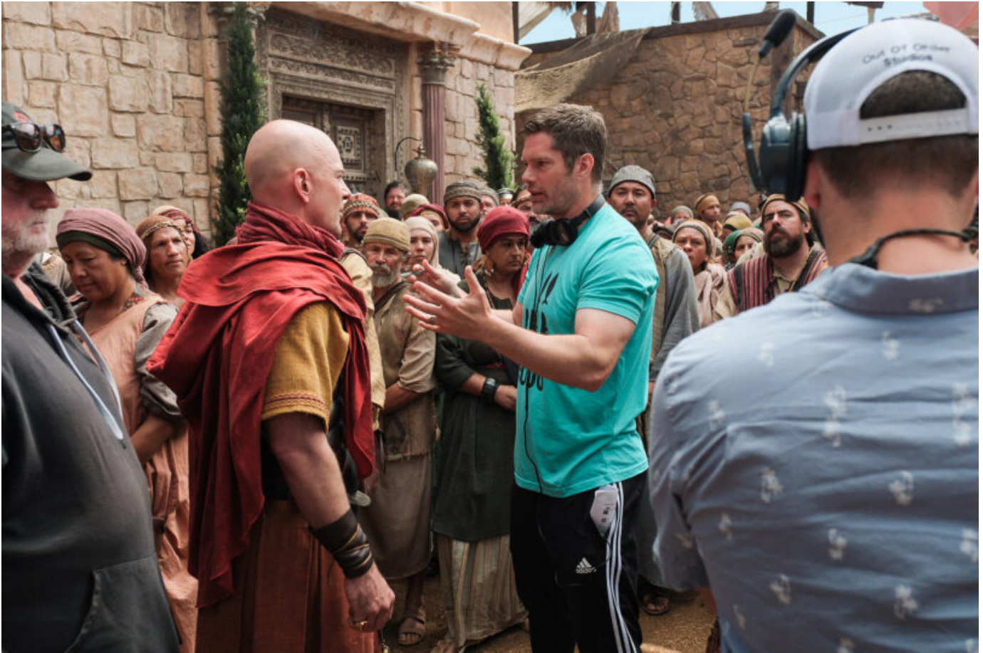
Director Dallas Jenkins, center right, on the set of "The Chosen" during Season Four.

Jenkins said The Chosen LLC and Angel Studios had "different ideas of how to interpret both the contract and what's going to sustain us in our future." Ultimately, he said, the pay-it-forward model that originated with Angel Studios wouldn't allow "The Chosen" to meet its goals of reaching a billion people — including those who can't pay for it — while also financing future seasons, said Jenkins.