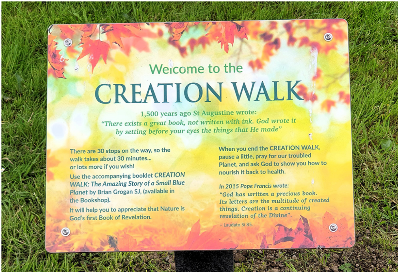
A sign is pictured from the Creation Walk at Ireland's national and international Marian and Eucharistic Shrine in Knock, County Mayo.