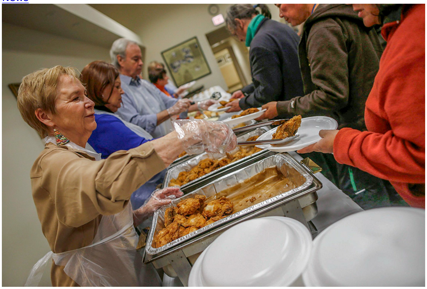
In a 2013 file photo, volunteers serve people during a free dinner provided by the Emergency Assistance Department of Chicago Catholic Charities.