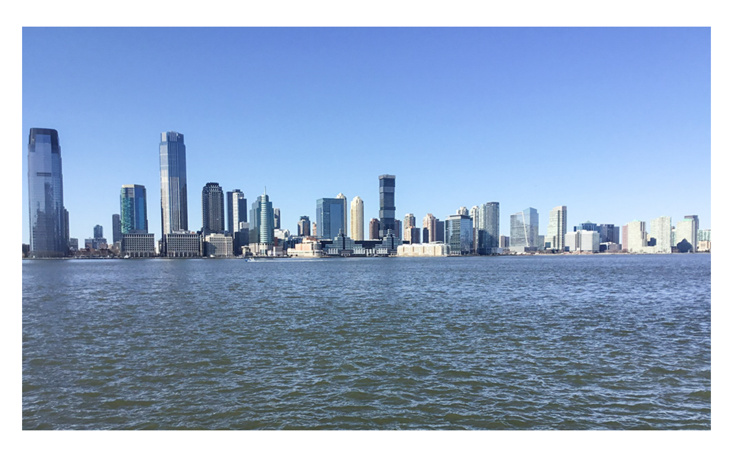
The skyline of Jersey City, New Jersey, is seen from Manhattan, New York.

He sees himself as a combination of traditional and progressive strands of Catholicism. He's recited the rosary with a group of largely older, women parishioners, whom he described as wise elders and faith leaders. Asked to lead the group in prayer, he demurred, for fear he wouldn't remember the rosary formula he learned in his baby boomer Catholic youth.