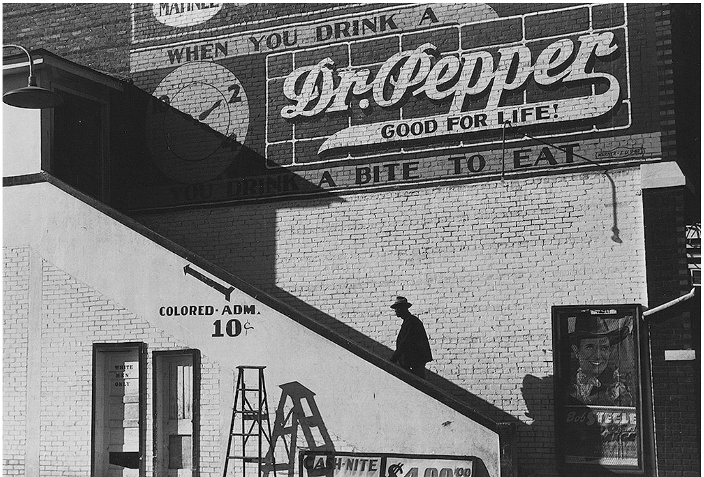
A Black man enters a segregated movie theater in Belzoni, Mississippi, in 1939.

Concerning what Harris calls America's new form of "Black lynching," statistics are offered from the Death Penalty Information Center, which estimates that 3% of executions that have occurred in the U.S. were botched (i.e., inmates catching fire during electrocutions, folks being strangled during hangings, or individuals receiving the wrong dose of lethal injections) between 1890 and 2010 .