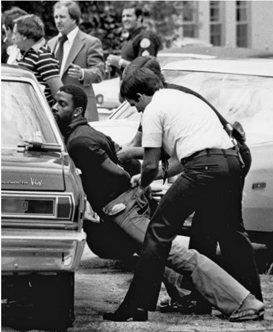
Police handcuff a suspect during a drug raid in Miami, May 18, 1979.

Regarding the disproportionate imprisonment of Black men, Harris points to the study " A Generational Shift: Race and the Declining Lifetime Risk of Imprisonment ," which found that during the period known as the "prison boom" (1973-2009), " 'the number of individuals incarcerated in prisons increased by more than 700%,' Black men born during 1981 and 1984 being most impacted, with one in three incarcerated."