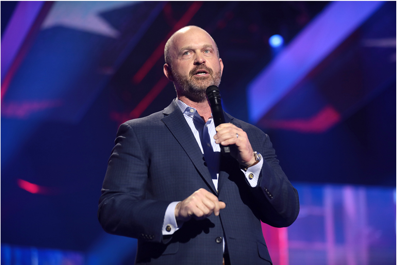
Kevin Roberts, president of the Heritage Foundation, speaks with attendees at Turning Point USA's AmericaFest in Phoenix in December 2022.

Before joining Heritage in 2021, Roberts was CEO of the Texas Public Policy Foundation, a conservative think tank in Austin that promotes fossil fuels and fights climate action. While there, he became a top adviser to Gov. Greg Abbott, who is also Catholic.