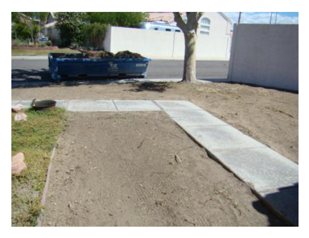
A before photo of Margie Klein's yard

This past year, I had to retrofit my landscape. The traditional green lawn was swallowing up too much water. Not only was it a gluttonous use of the precious water resource, but also water rates had been jacked up to unaffordable costs. True, my husband and I could afford our lush sanctuary when we were working, but now with both of us retired, cutbacks had to be made. Furthermore, the increasingly hot and brutal climate forced our hands.