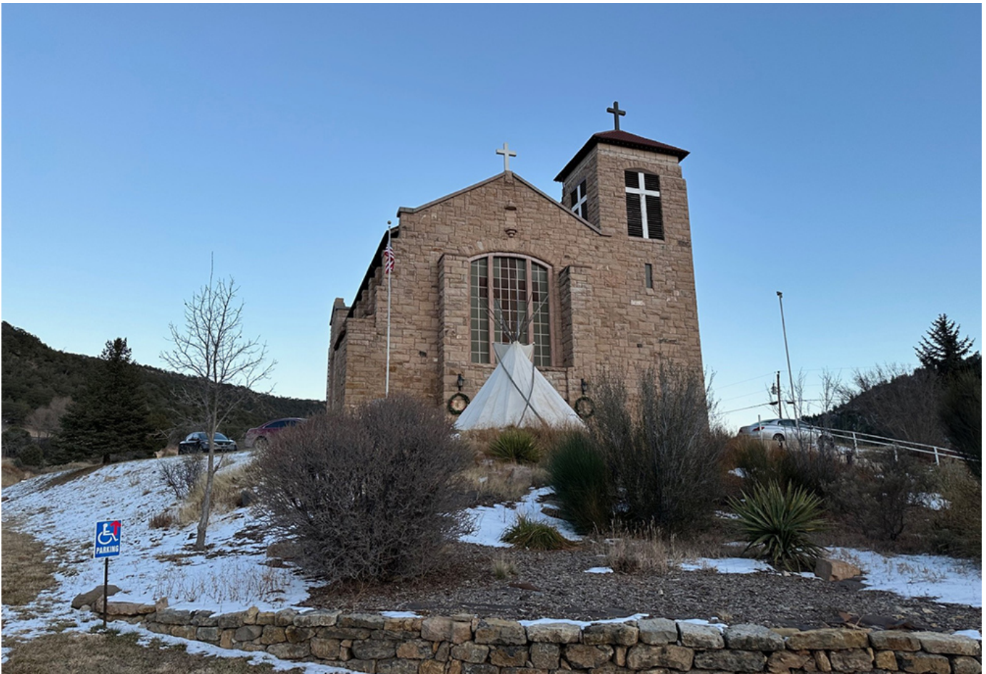
The exterior of St. Joseph Apache Mission in Mescalero, New Mexico

Through it all, our Apache friends slowly became acquainted with Christianity. Their traditional spirituality was that of a practical religion, that is, it was how they lived in the land the Creator had given them. A sense of the sacred surrounded all aspects of life. Christianity, being missional or evangelical, could puzzle them. For example, their earliest contacts with Spanish Jesuit missionaries coming up from New Spain was typically at arm's length. They thought of them as witches, because, among other observations, Jesuits always had a supply of food, wore heavy black robes even during the hot summer months, and did not live with women. In the end, they decided to allow them to live, because the Jesuits were a source of food.