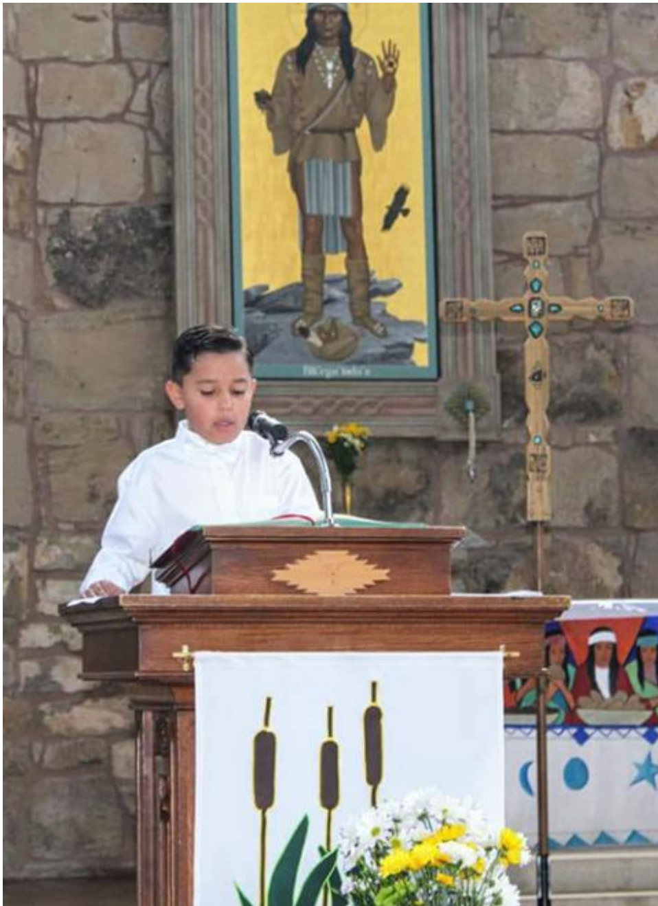
"Apache Christ" is seen inside the church of St. Joseph Apache Mission in Mescalero, New Mexico.