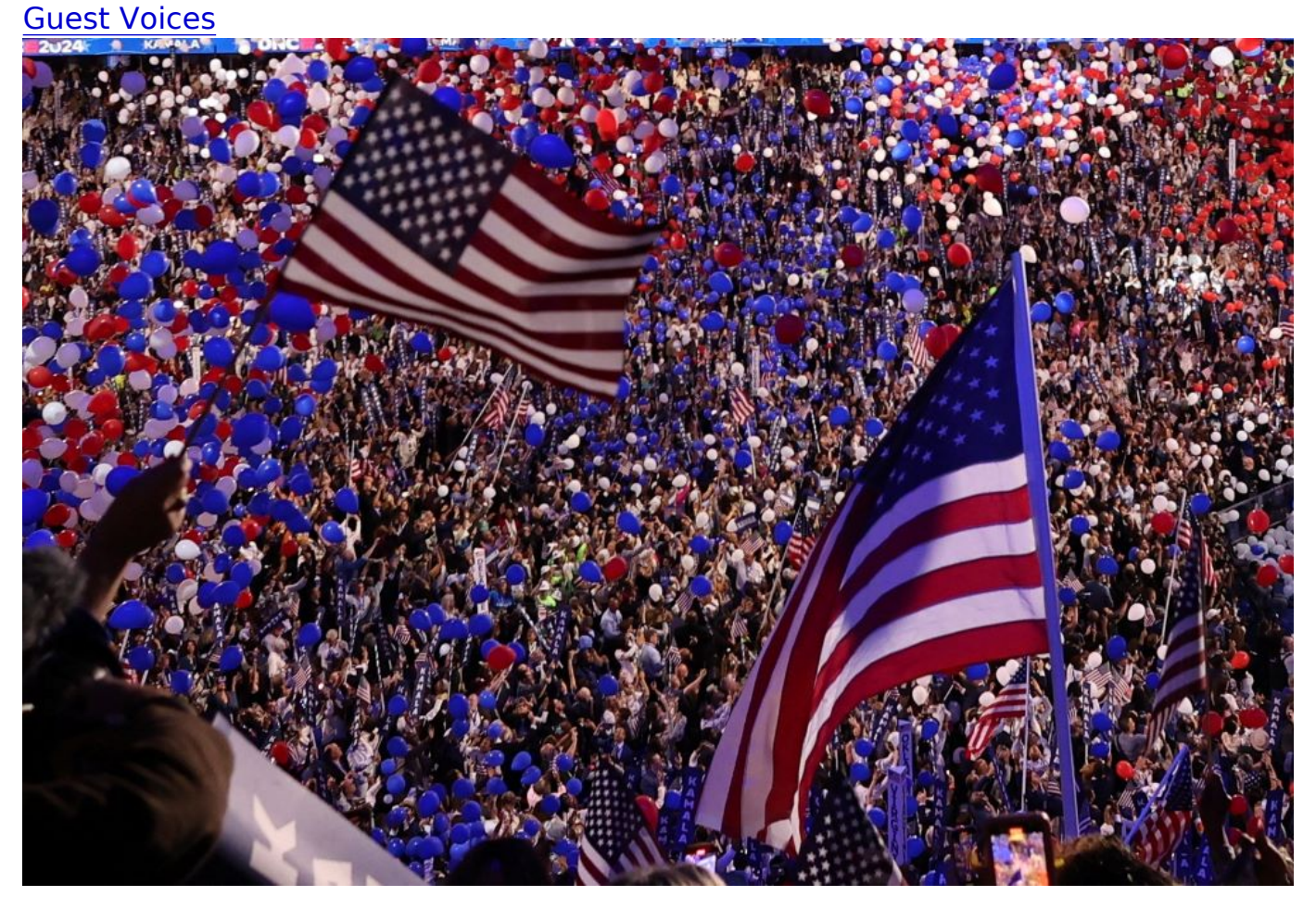
U.S. flags and balloons fill the United Center after Vice President Kamala Harris, the Democratic presidential candidate, gave her acceptance speech during the Democratic National Convention in Chicago Aug. 22.