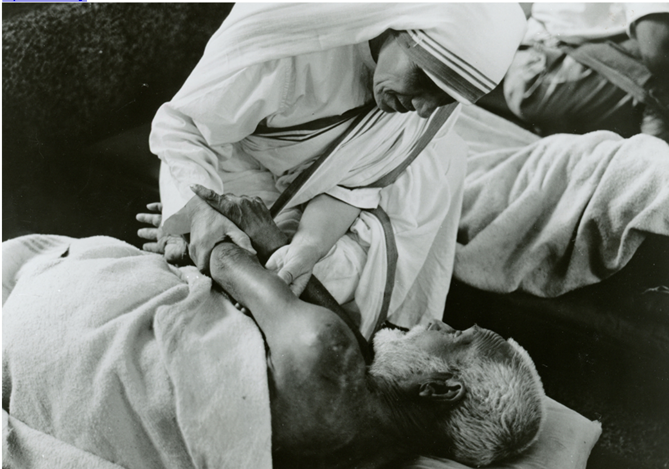
Mother Teresa of Kolkata cares for a sick man in an undated photo.